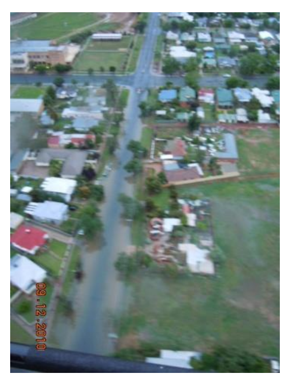
Photo 25 Inundation on Shaw St (Gurwood St is the horizontal road).