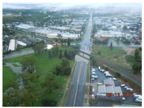
Photo 48: Bolton Park to the left and low points on Tarcutta St and Sturt Hwy under Railway.