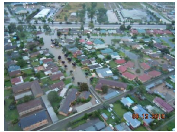
Photo 8: Inundation on Vestey St connecting to Moorong St/ Olympic Hwy