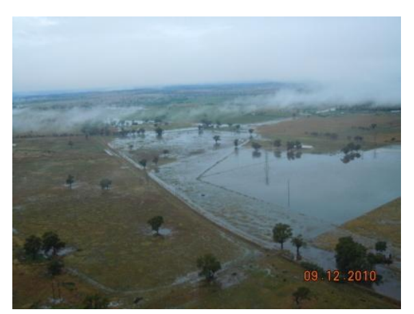
Photo 54: Inundation behind railway embankment (between Marshalls Ck and Kooringal Rd,