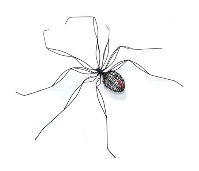
Meet the Artist