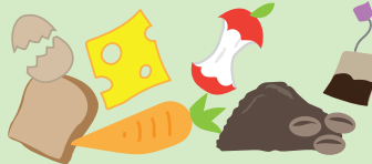
Dairy & food scraps

All of the below (compostable) items can go in the green lid FOGO bin.