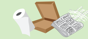
Paper towel, shredded paper, uncoated cardboard & newspaper