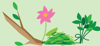
Garden trimmings, weeds & grass clippings