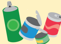
Cans & metal tins