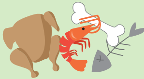
Meat & bones