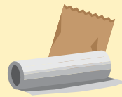
Aluminium foil & paper lunch bags