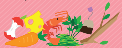
Compostable food & garden waste