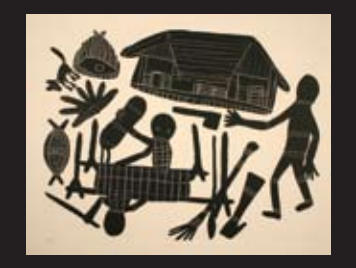
Djurrutjini, Charlie Yolngu houses nd, lithograph, 63.3 x 48.3 cm