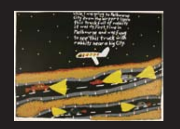
Abdulla. lan Truck full of rabbits 2004, silkscreen, 96.4 x 63.3 cm

The notion of Plenty , in this context, refers to abundance, bounty and profusion. It is a word that can apply to the fecundity, both literal and cultural, as depicted by a number of artists in this exhibition. It also conjures up the notion of multiplicity, a state inherent to the printmaking process.