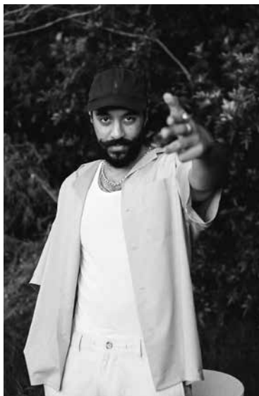
MOWGLI [DJ SET]