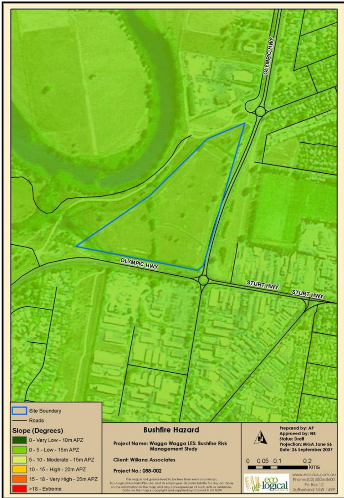
Figure 1. Bushfire Hazard Assessment