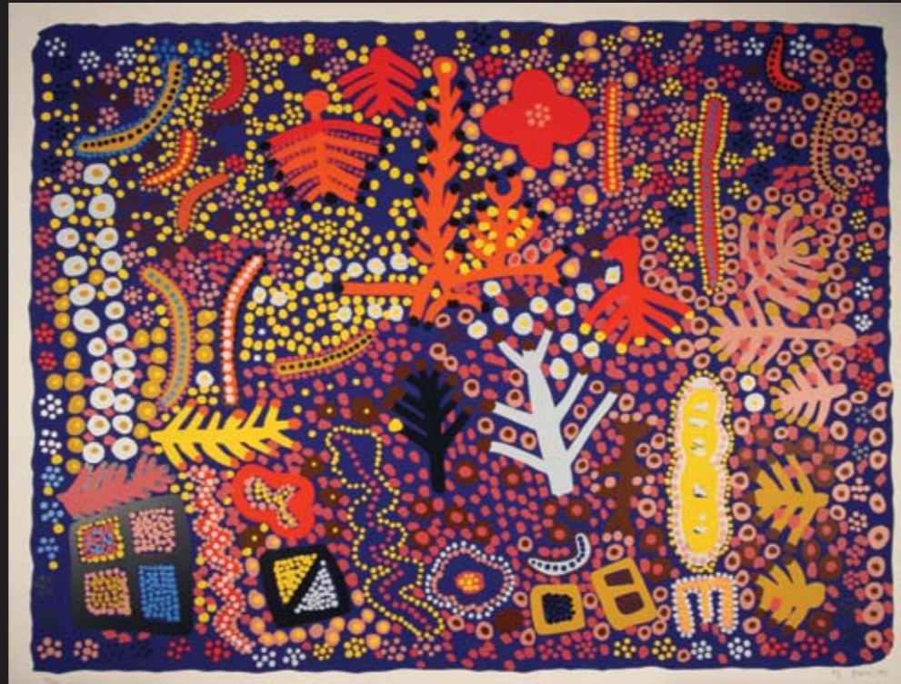
Naparrula, Marlee Flowers and trees 1998, screenprint, 152.4 x 101.4 cm