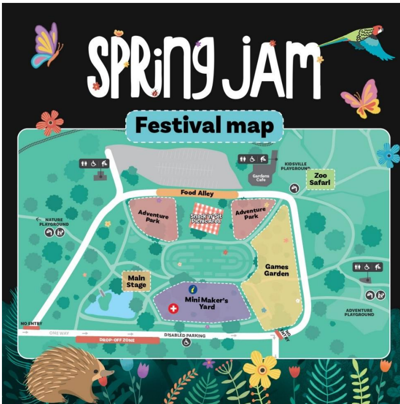
Spring Jam festival map.

Contact 6926 9190 or media@wagga.nsw.gov.au