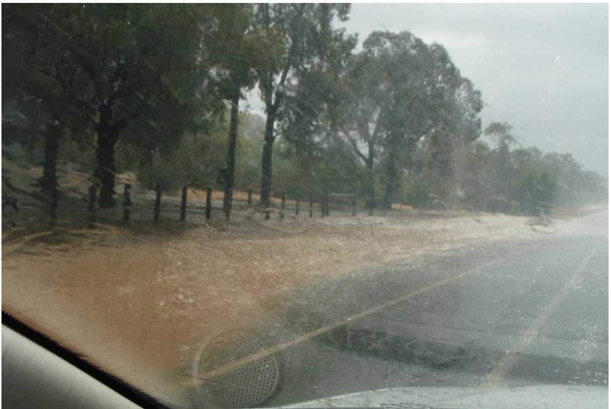
Figure 12 2007