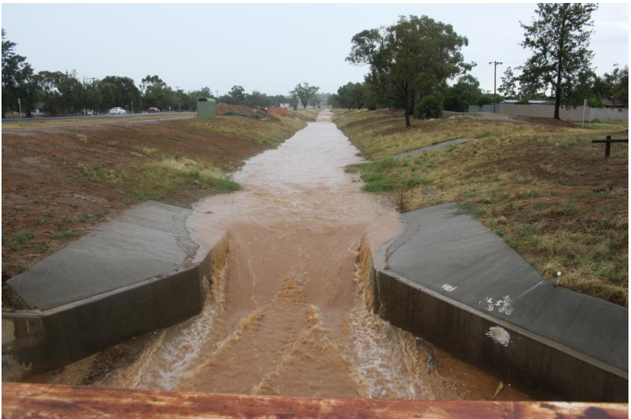
Figure 35 – Looking U/S of Dalman Parkway