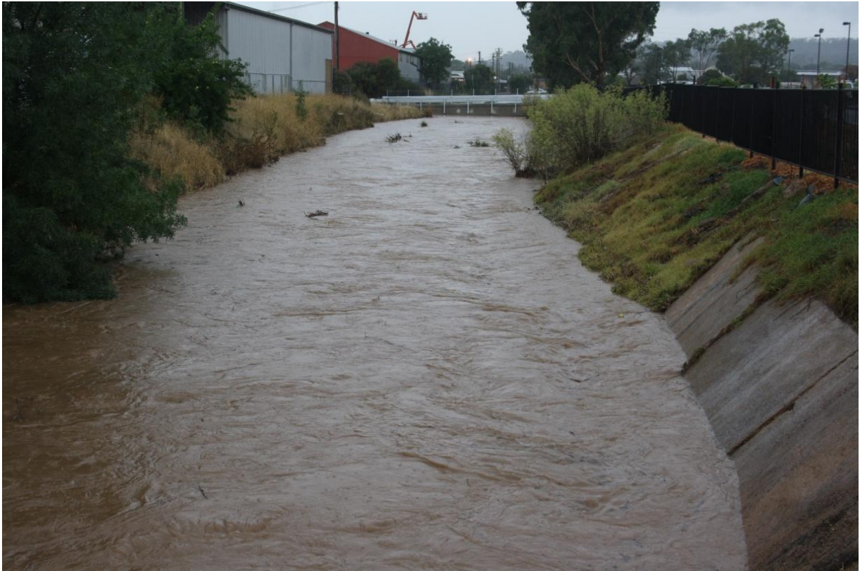
Figure 36 – Looking U/S from Ashmont confluence towards Bunnings Bridge (Northern)