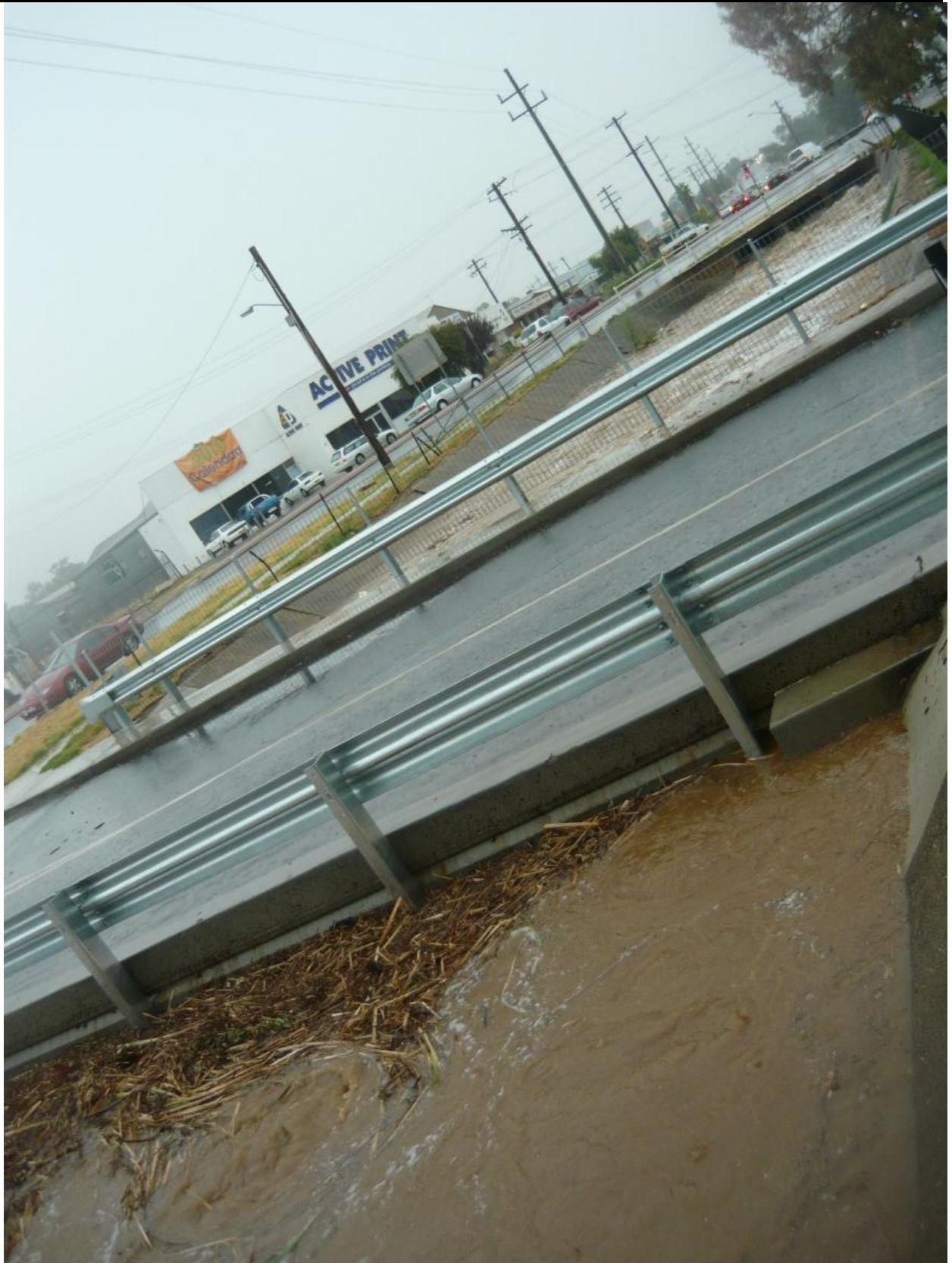
Figure 16 - Bunnings Bridge (Eastern) looking South-East