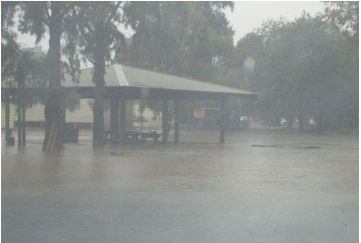
Figure 47 – Inundated park near Shaw Street.