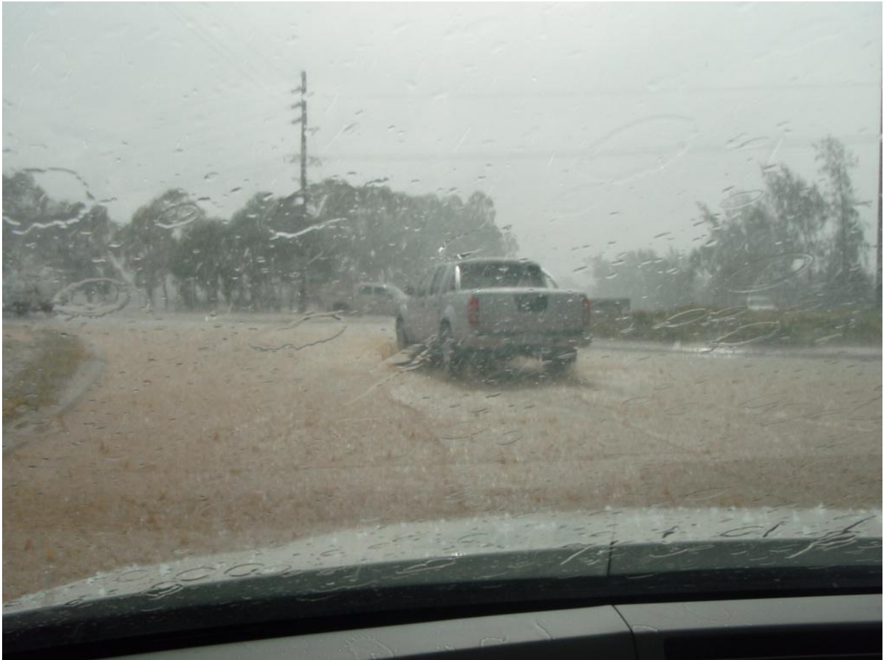
Figure 11 2007