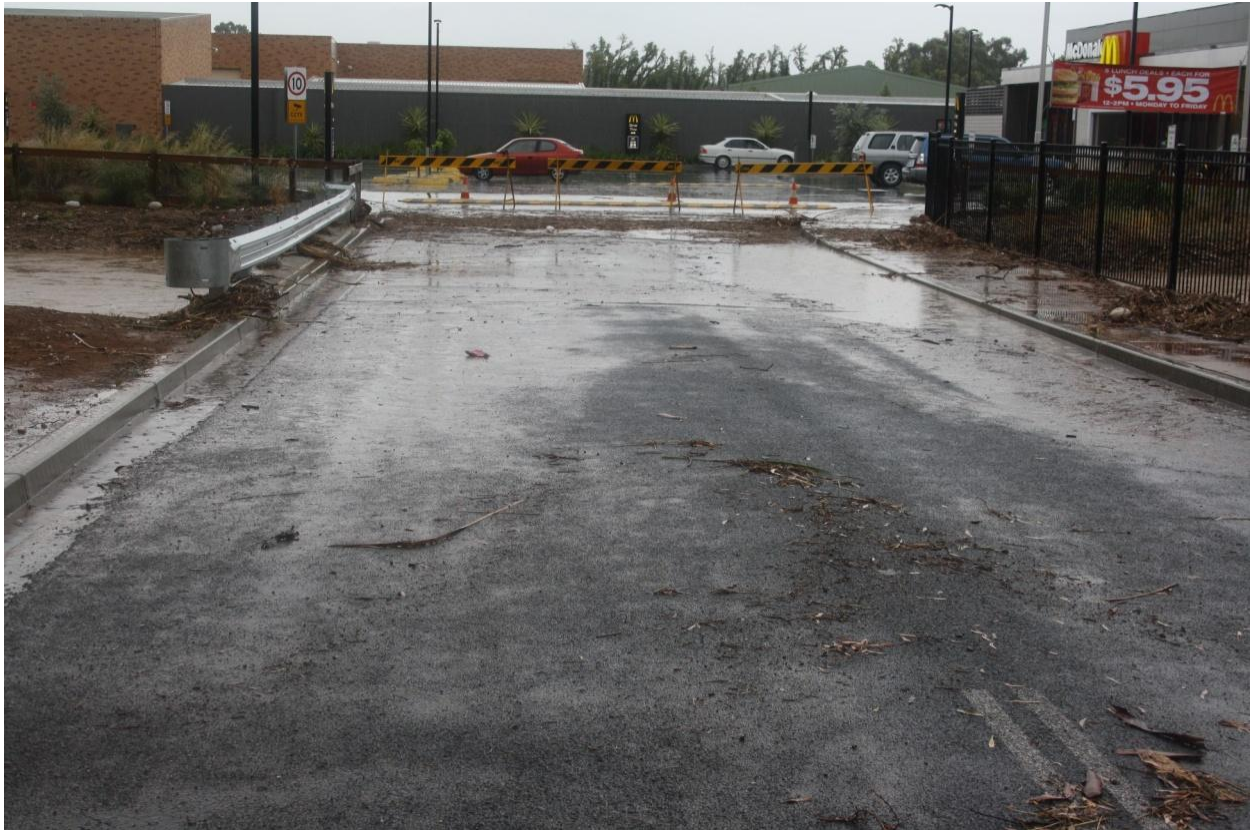
Figure 12 - McDonalds Bridge post-inundation (looking West)