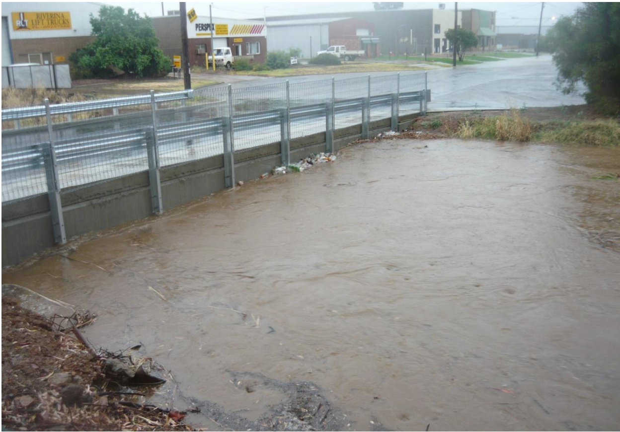
Figure 3 - Bunnings Bridge on Northern side (U/S)