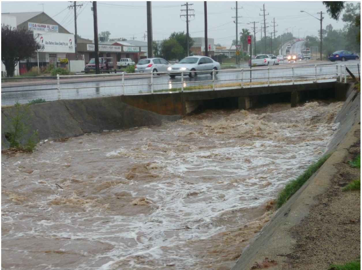
Figure 18 - Looking South from next to Bunnings Site