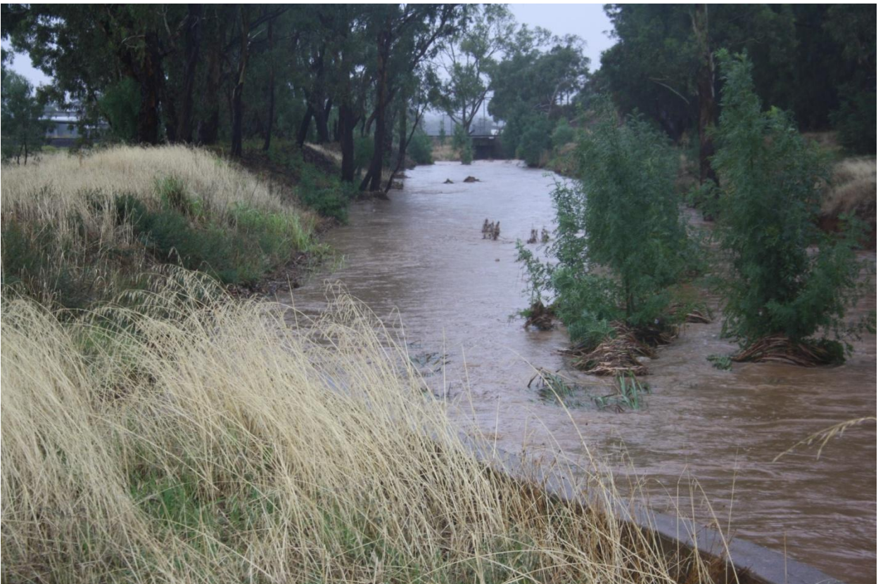
Figure 21 – Looking D/S from Pound Access to Railway culvert