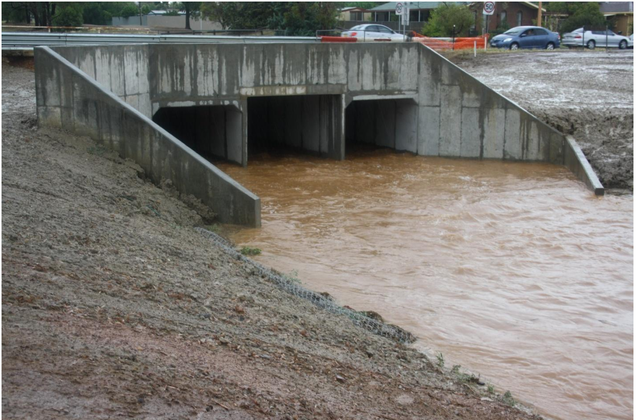
Figure 23 – Looking U/S at Dalman Parkway culvert