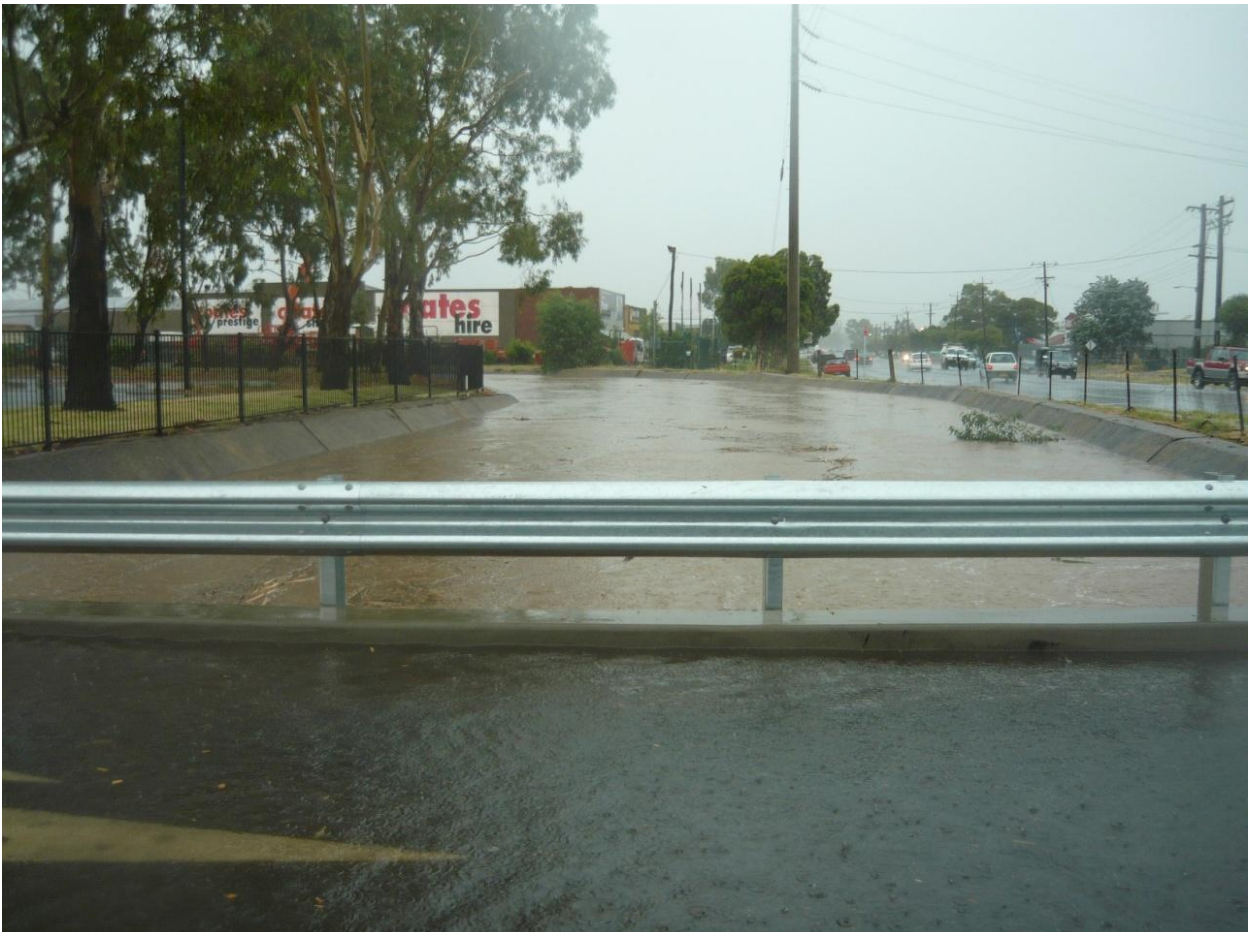
Figure 6 - Bunnings Bridge on Eastern side looking D/S and North