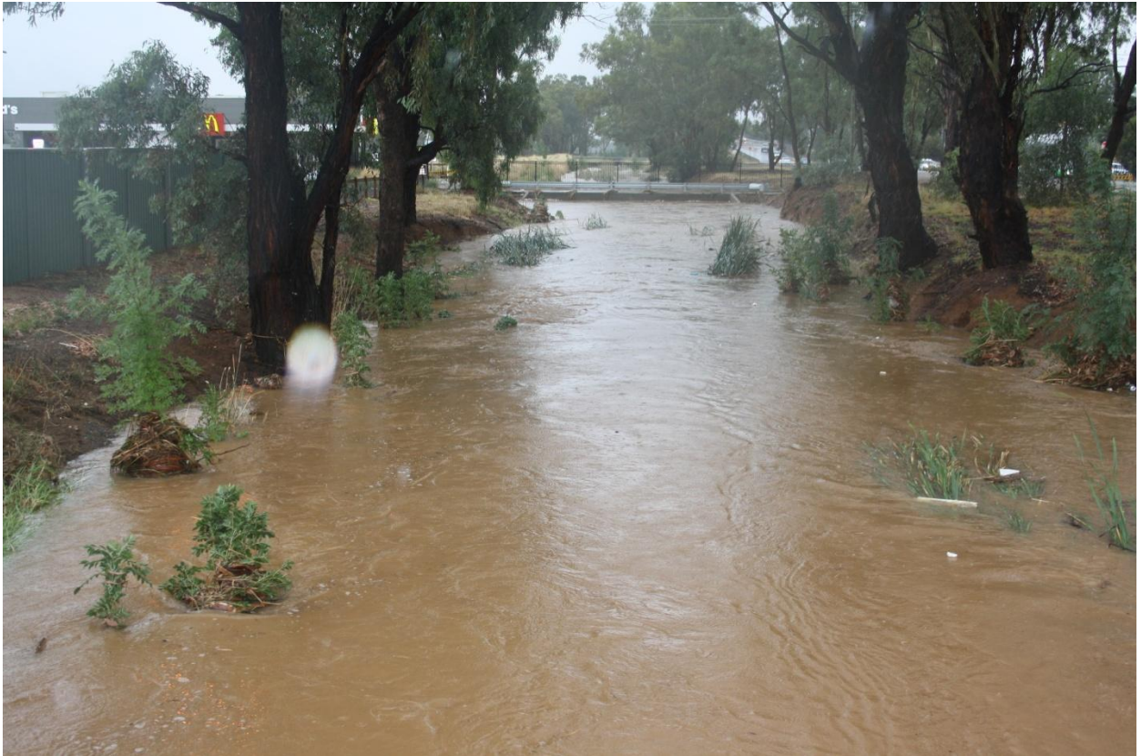
Figure 22 – Fernleigh Rd looking D/S and North to McDonalds Bridge