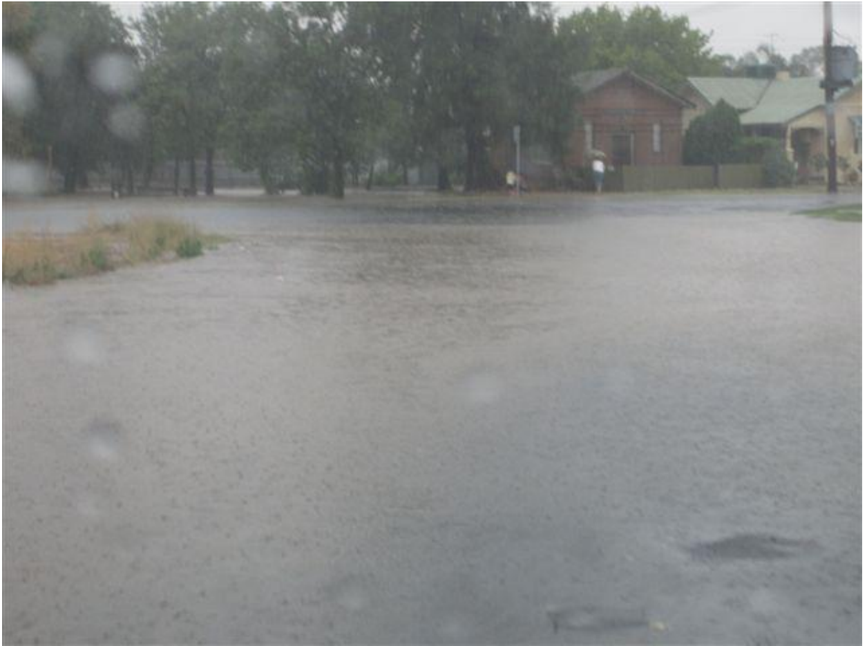
Figure 46 – Looking at Shaw Street inundation