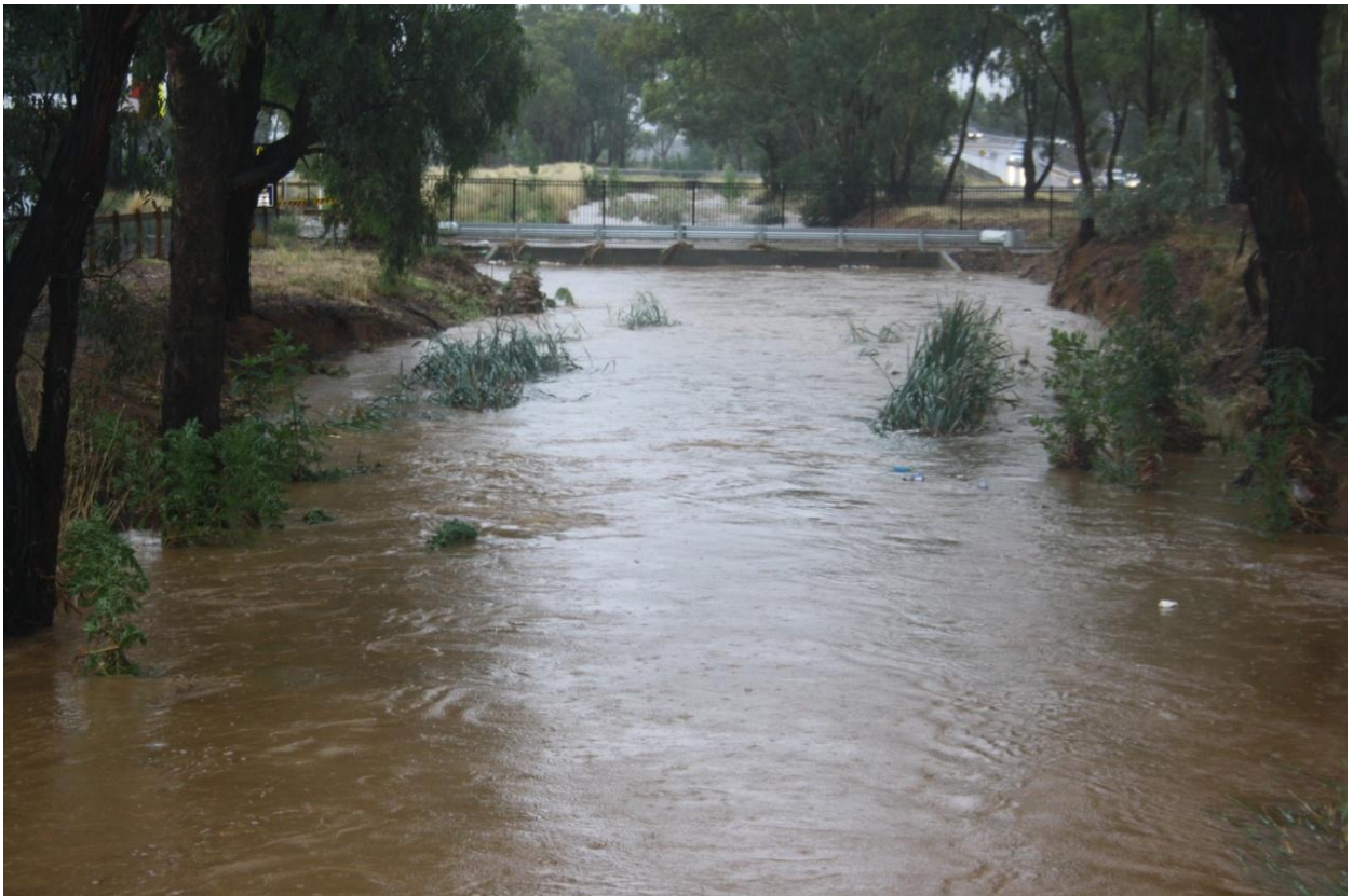
Figure 31 – Fernleigh Rd looking North at McDonalds Bridge.