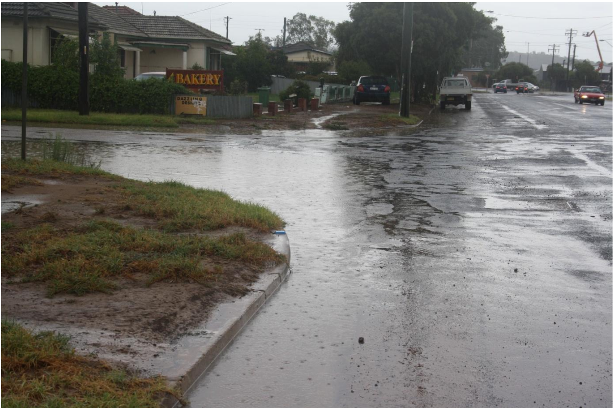
Figure 8 - Chaston St access to Mortimer Pl