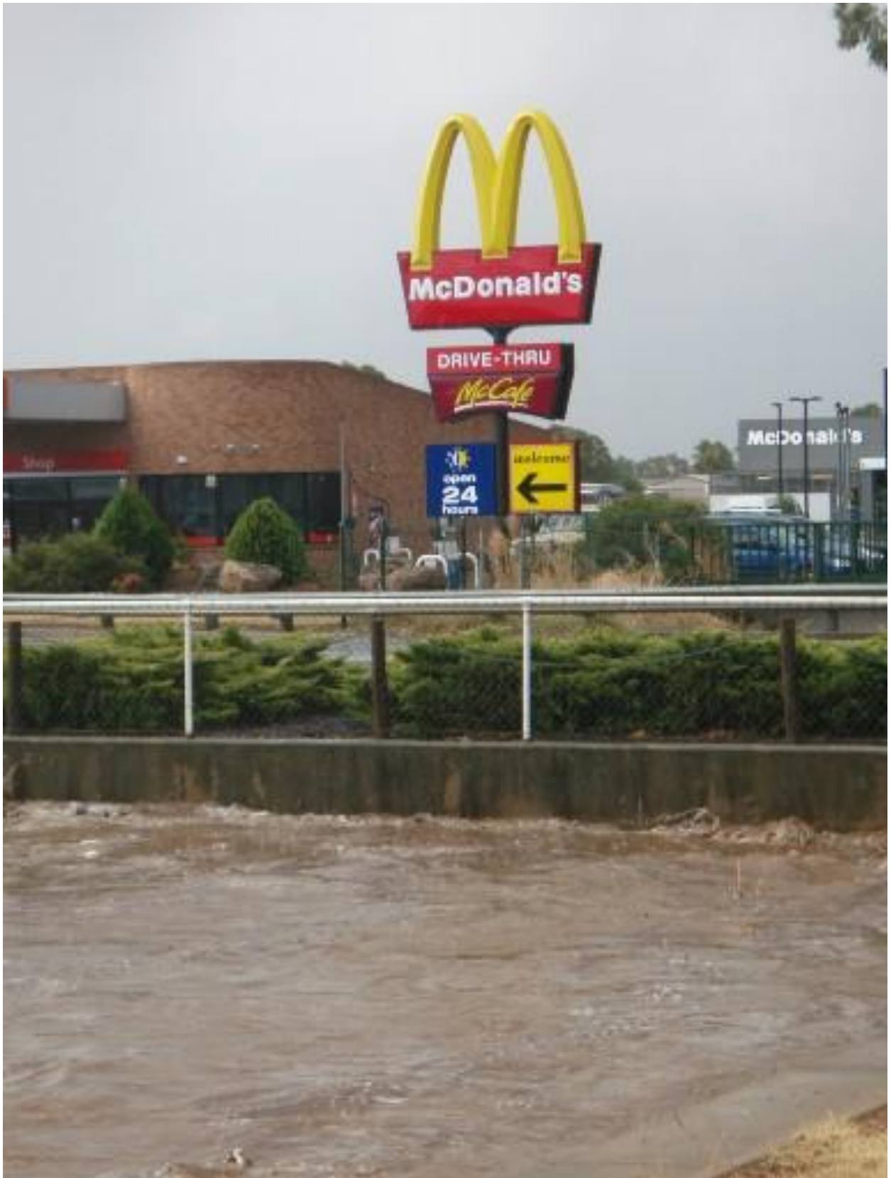
Figure 19 - Fernleigh Rd looking North (U/S)