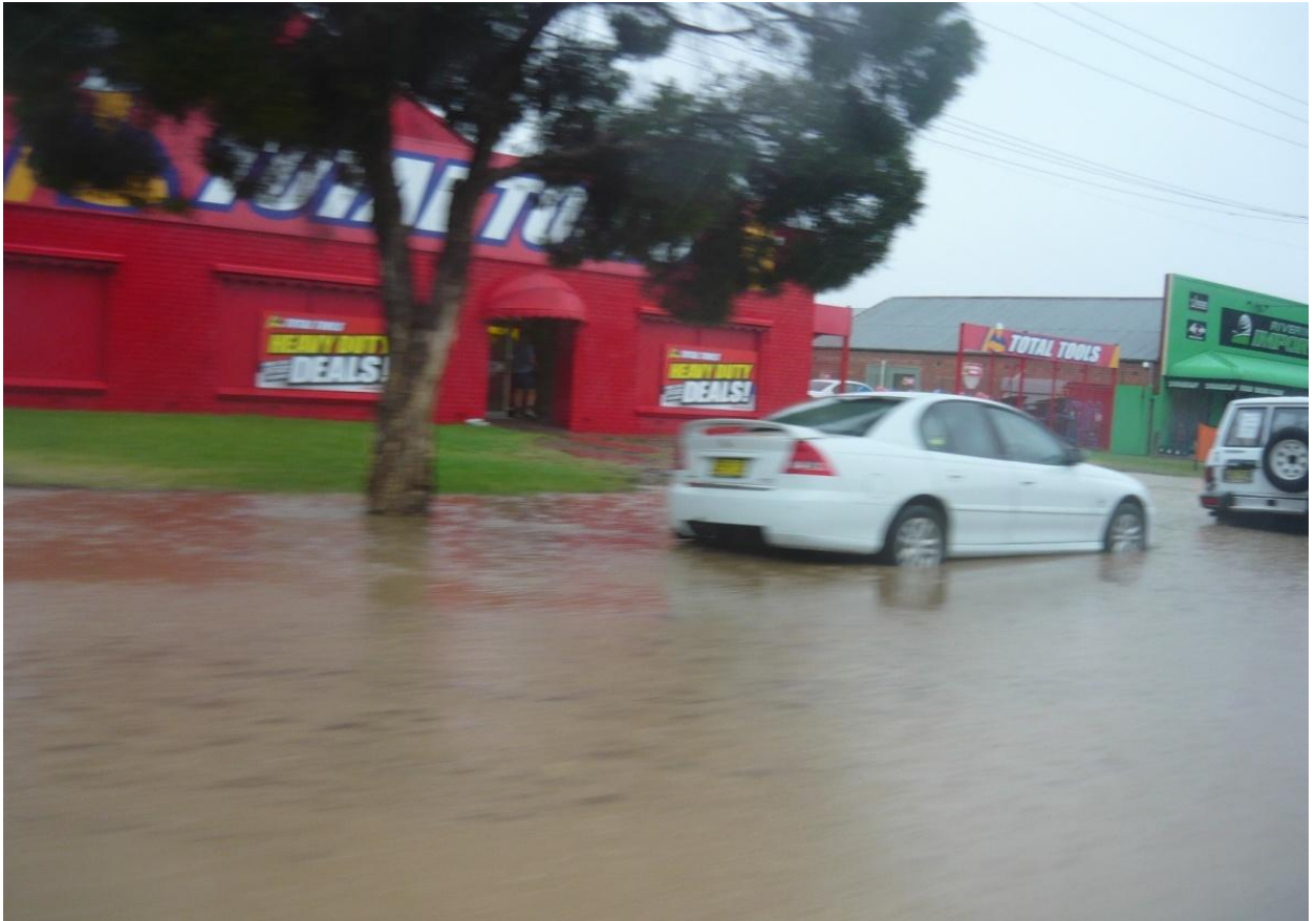
Figure 10A - Dobney Avenue