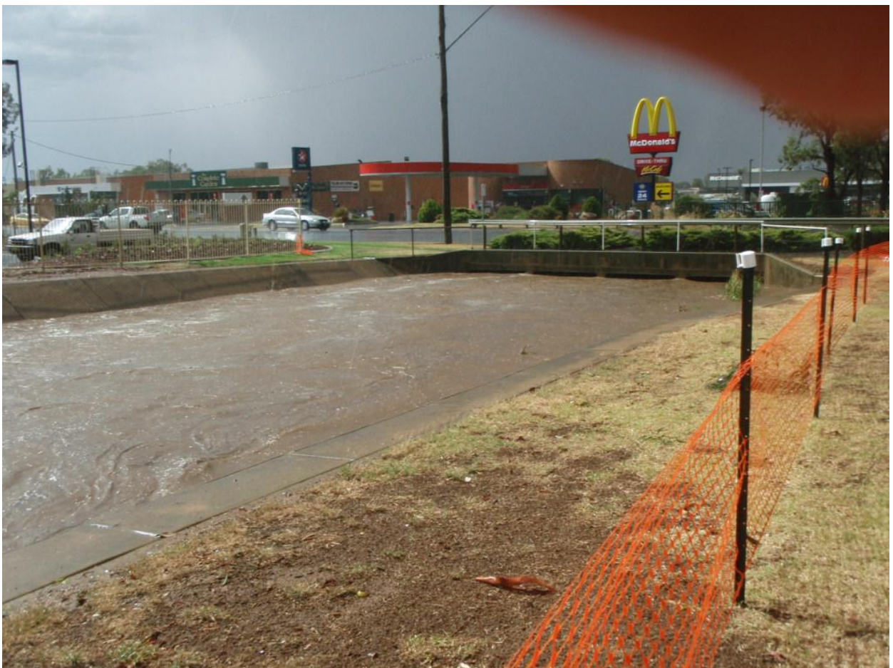
Figure 14 2007