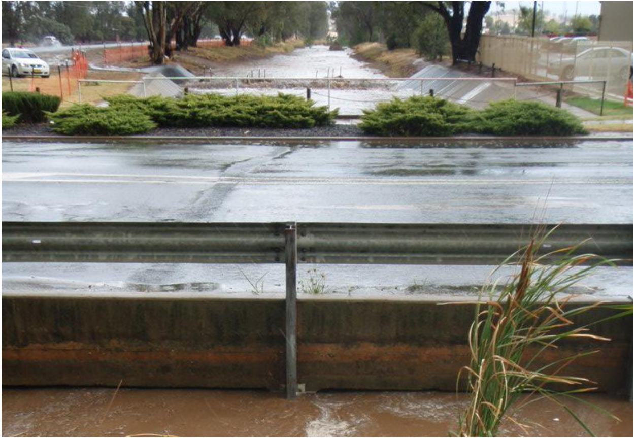
Figure 13 2007