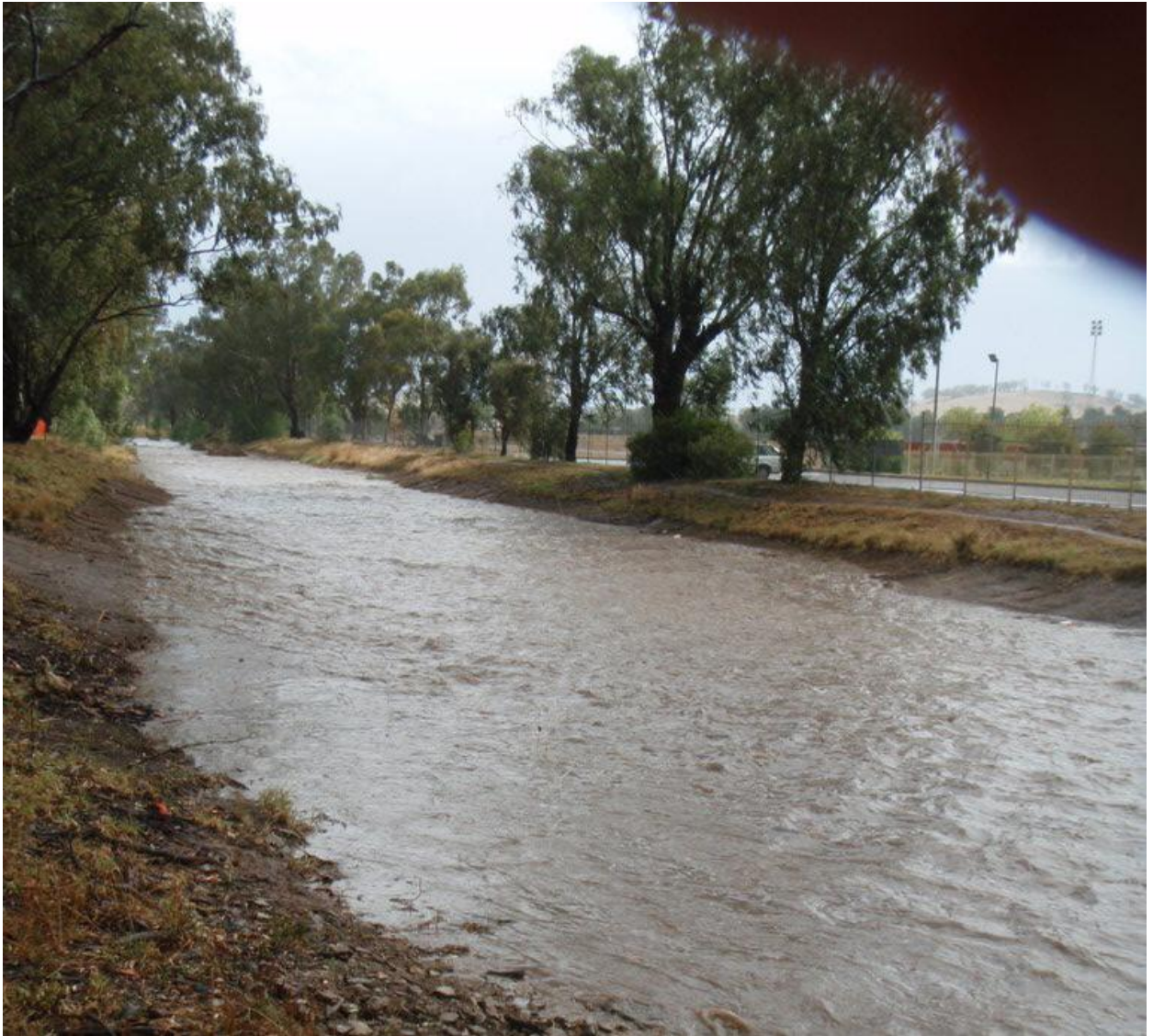
Figure 65 Unknown Event