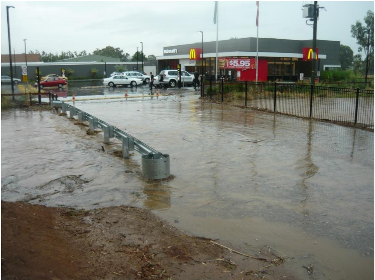
Figure 2 - Bridge at McDonalds