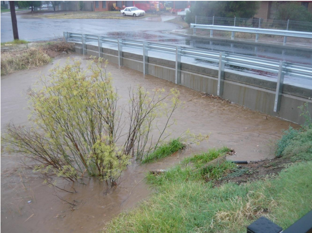
Figure 4 - Bunnings Bridge on Northern side (D/S)