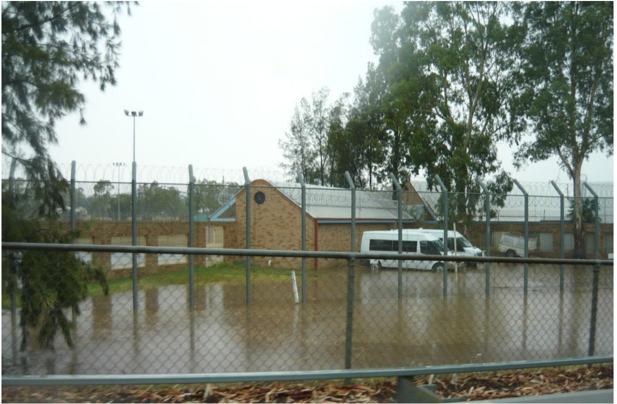
Figure 48 - Remand Centre