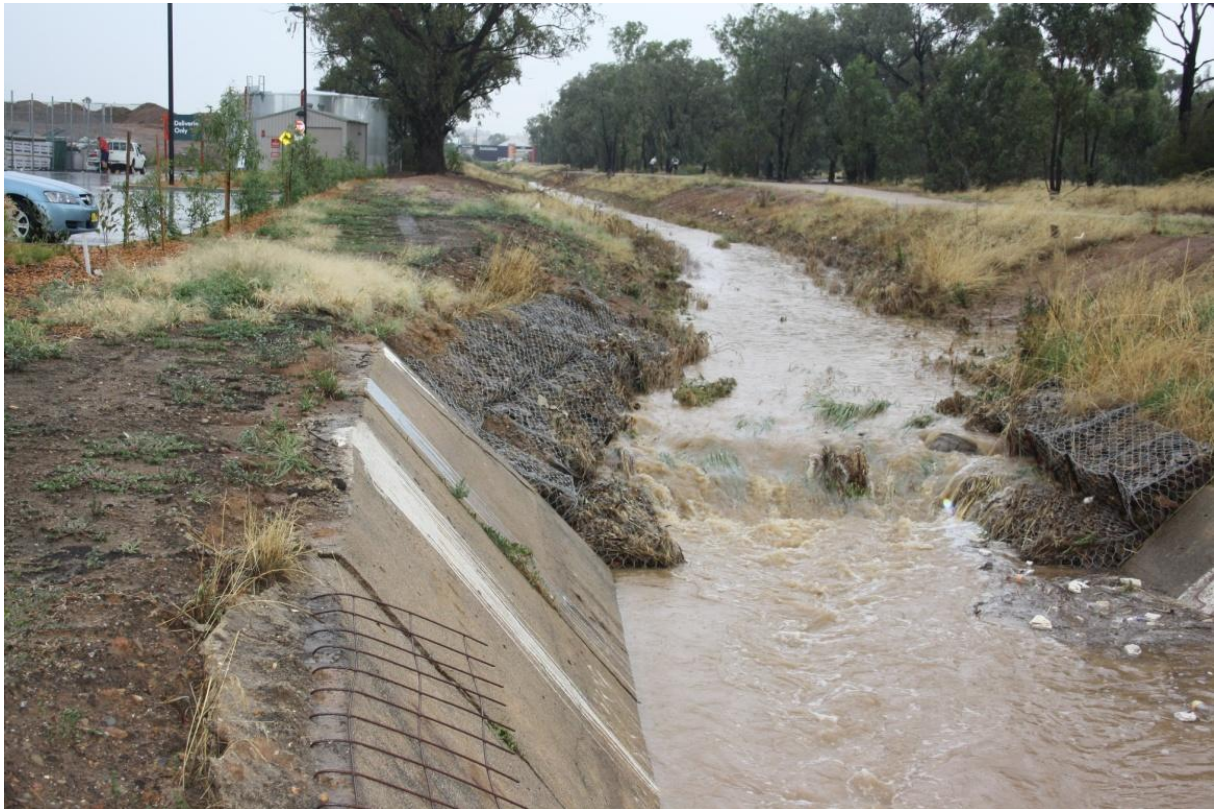
Figure 1 - Ashmont Drain U/S of junction with Glenfield Drain (West of Bunnings)