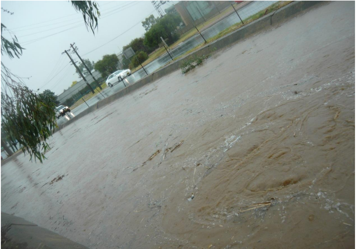
Figure 26 D/S Bunnings Bridge (east) looking North-East