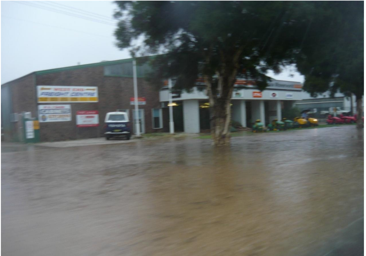
Figure 9 - Dobney Avenue North of Holden Dealership