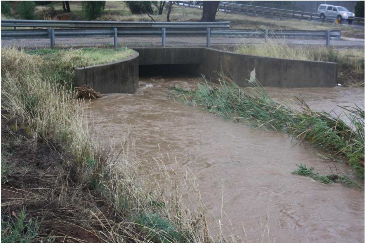
Figure 32 – U/S of Pound Access road looking North