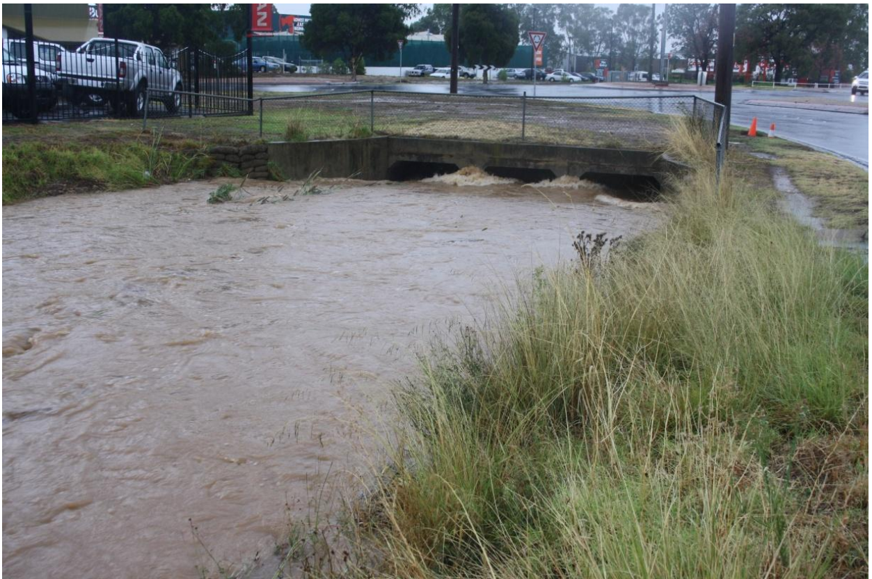
Figure 37 – U/S of Pearson/Dobney St roundabout looking North