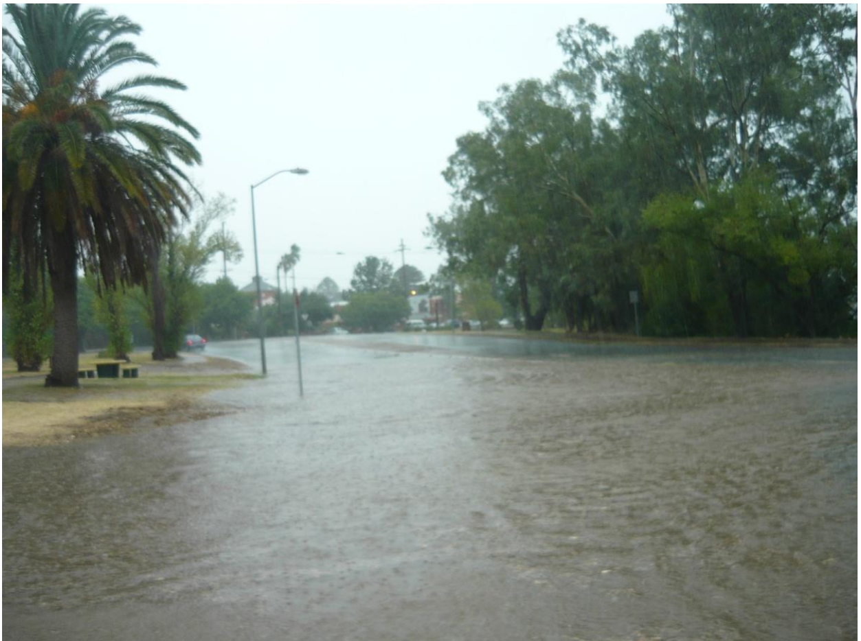
Figure 39 – Intersection of Morrow & Esplanade Road