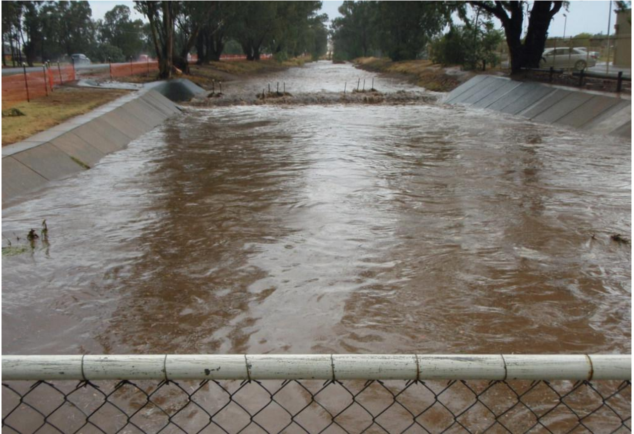
Figure 16 Unknown Event