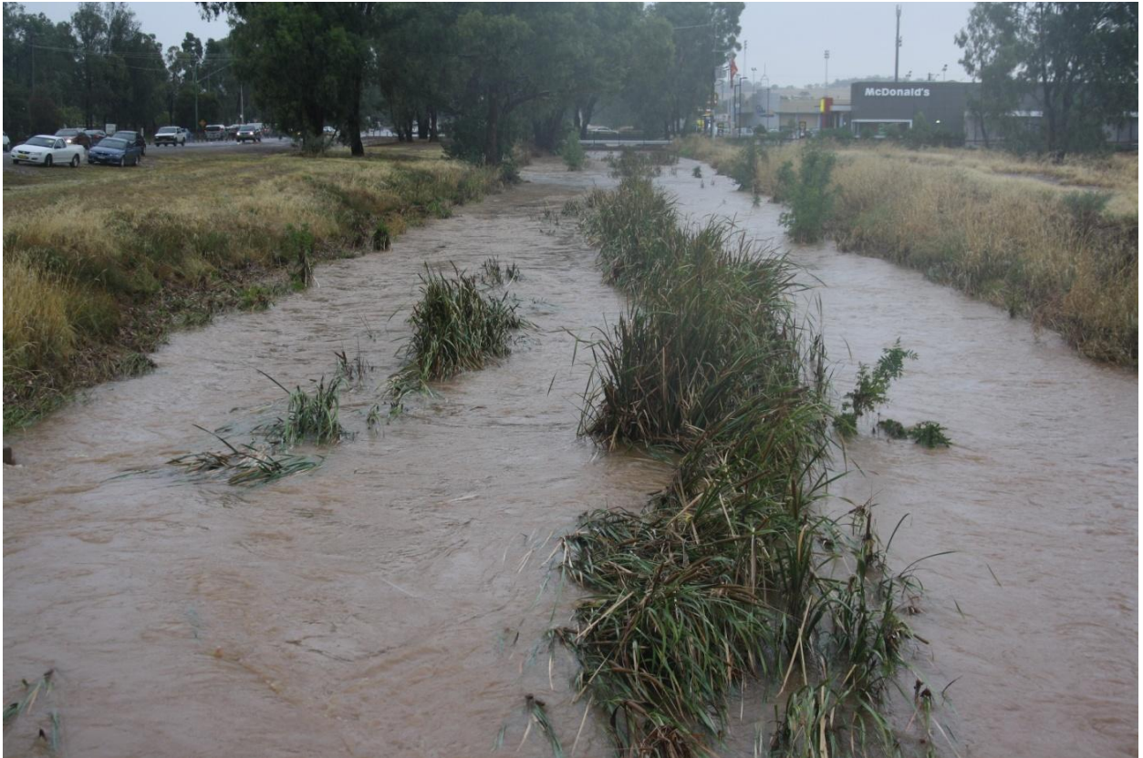
Figure 30 – Looking U/S from Pound Access Road (due South)