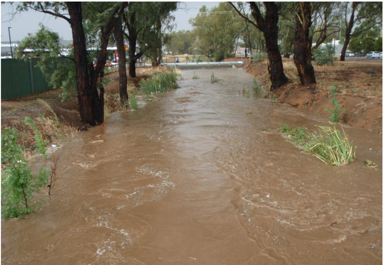
Figure 17 Unknown Event