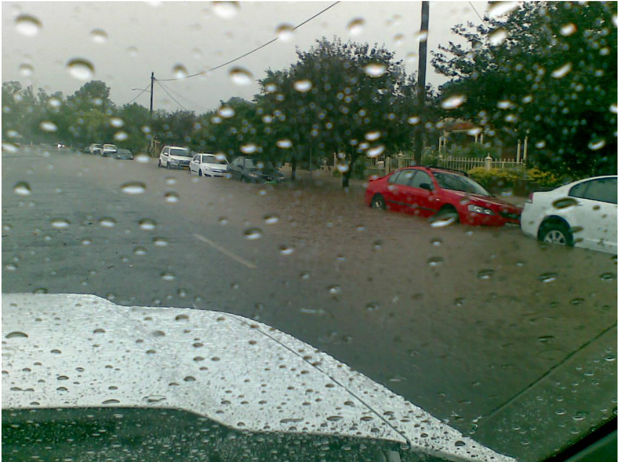
Figure 44 – Morgan Street looking East (Southern Side Street)