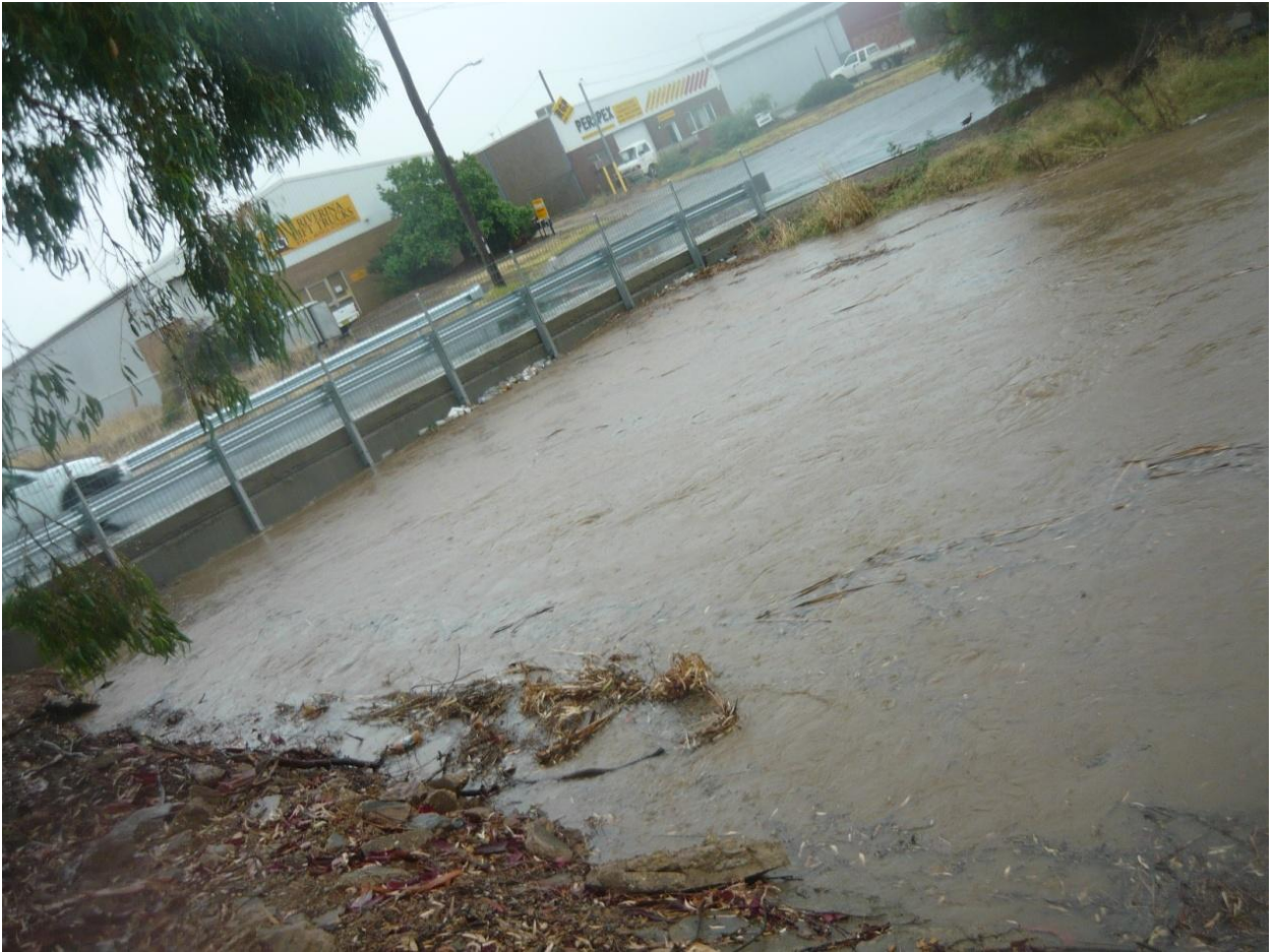
Figure 20 – Bunnings Bridge (Northern) looking North-West