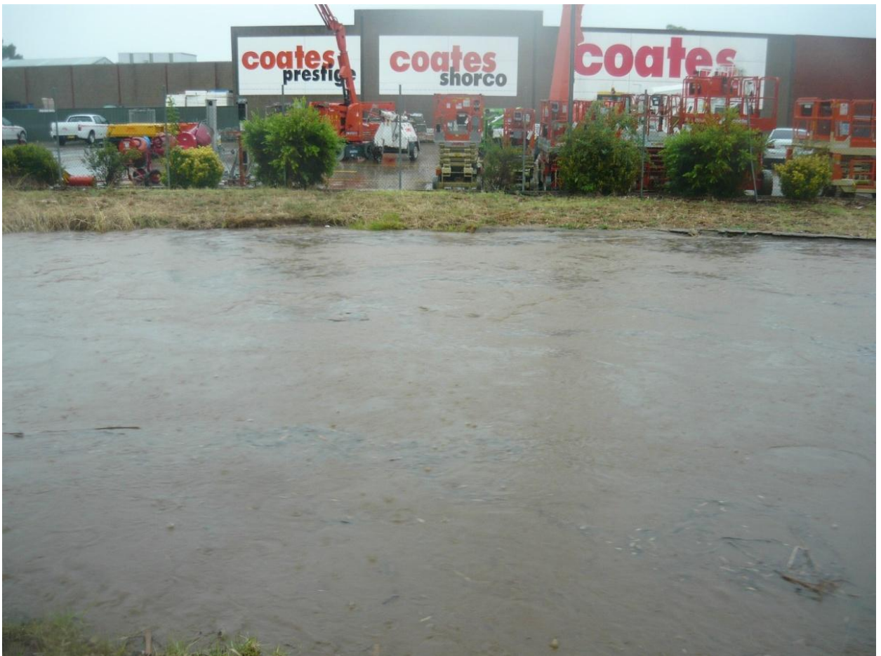
Figure 29 – Looking due North from Northern boundary of Bunnings