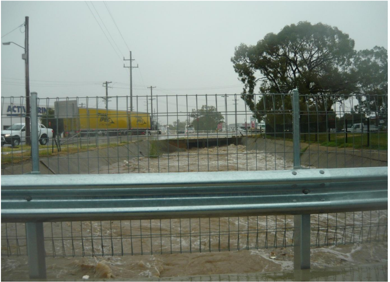
Figure 7 - Bunnings Bridge (Eastern) looking U/S