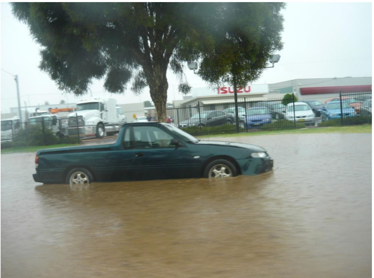
Figure 10 - Dobney Ave at Holden Dealership