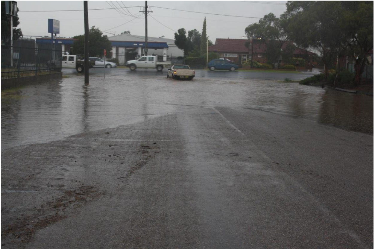
Figure 38 – Intersection of Pearson & Bye Streets