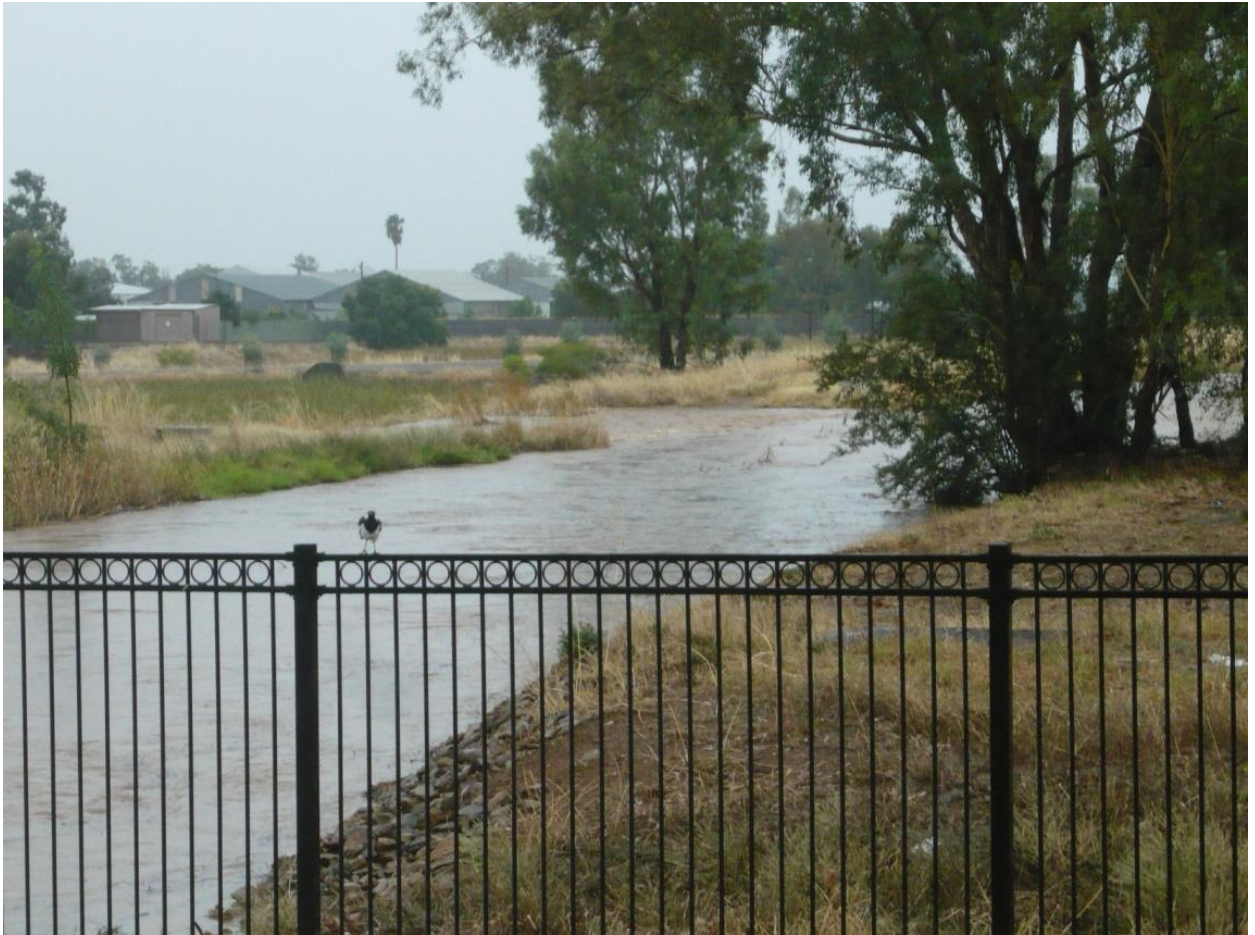
Figure 40 – Looking D/S from McDonalds Bridge to North-West