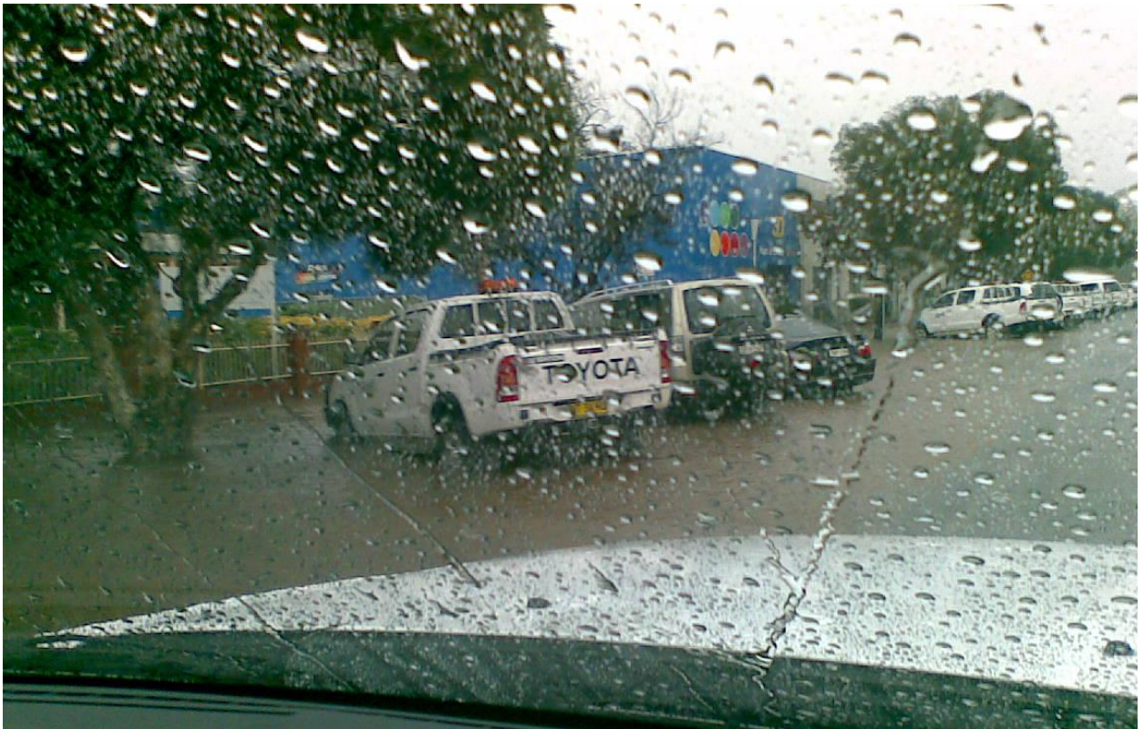
Figure 45 – Morgan Street (Northern Side Street)