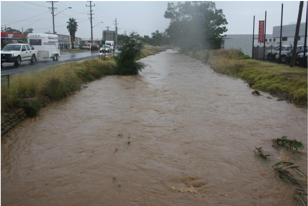
Figure 50 – Looking U/S of Pearson / Dobney Street Intersection