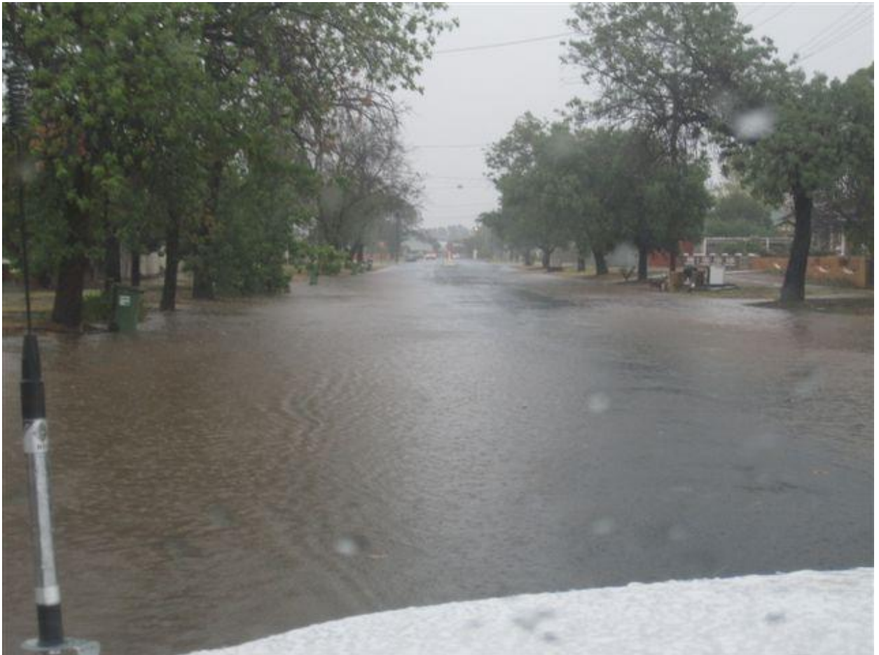
Figure 49 - Shaw Street