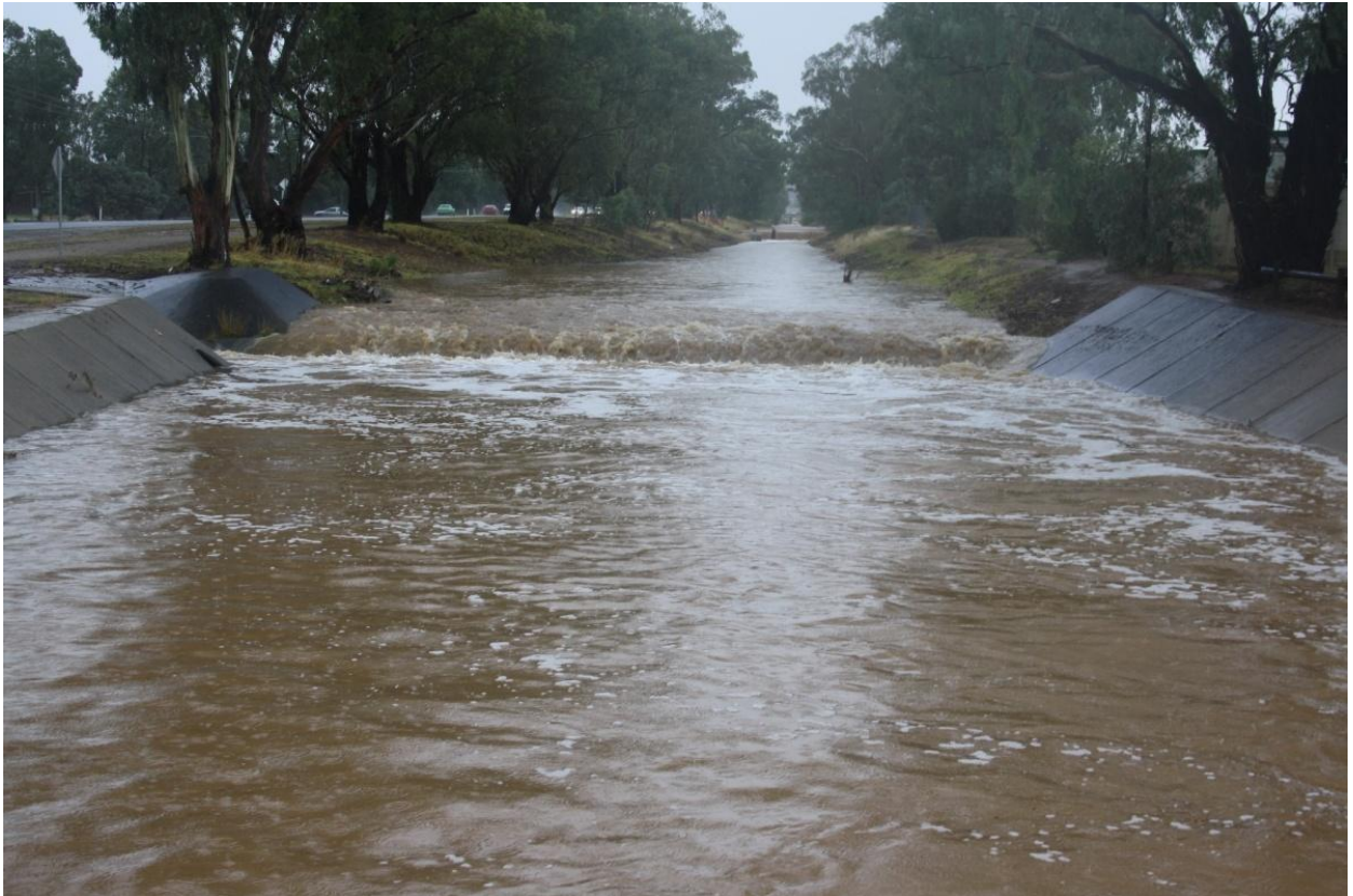
Figure 34 – Looking U/S of Fernleigh Road