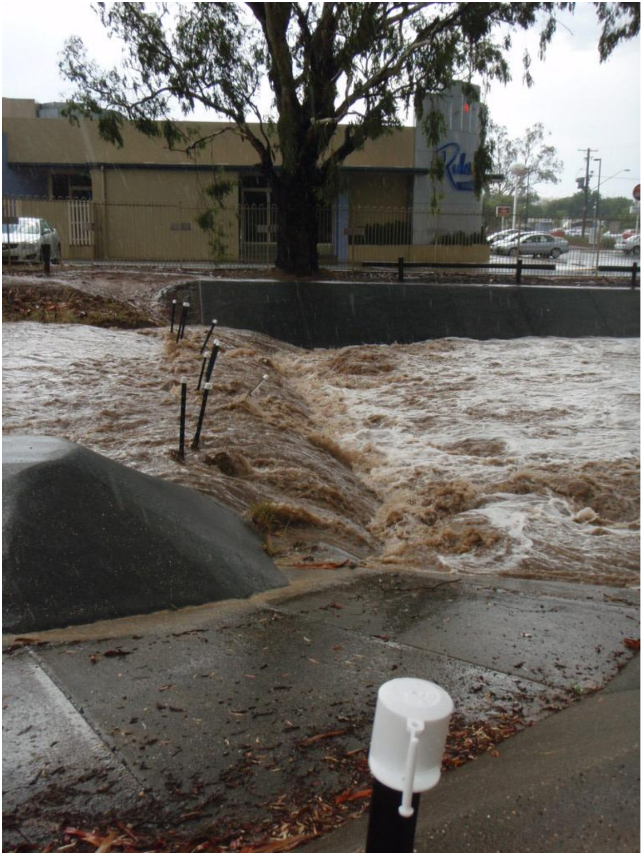
Figure 15 2007