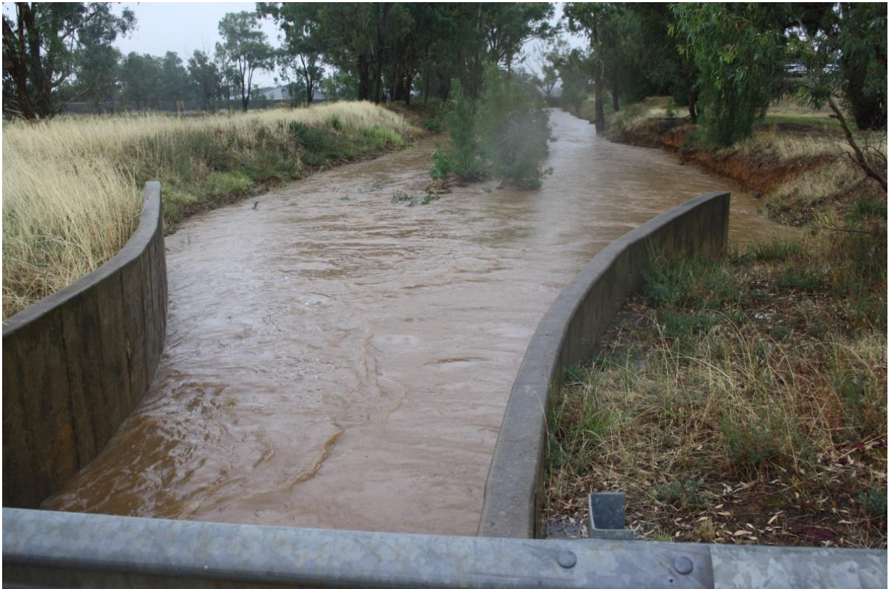
Figure 33 – Looking U/S of Pound Access Road