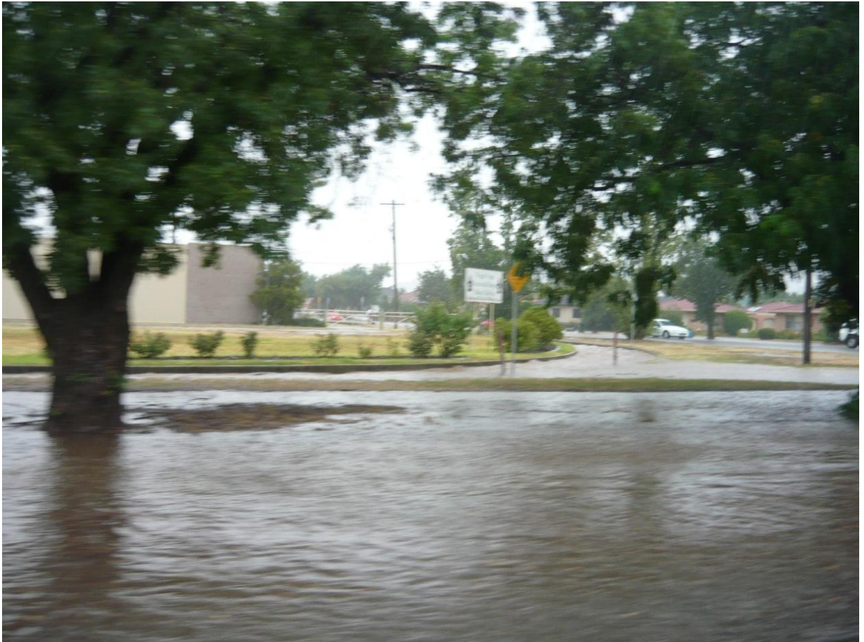
Figure 42 – Morgan Street Drain from Docker Street (Docker St flooding in foreground)