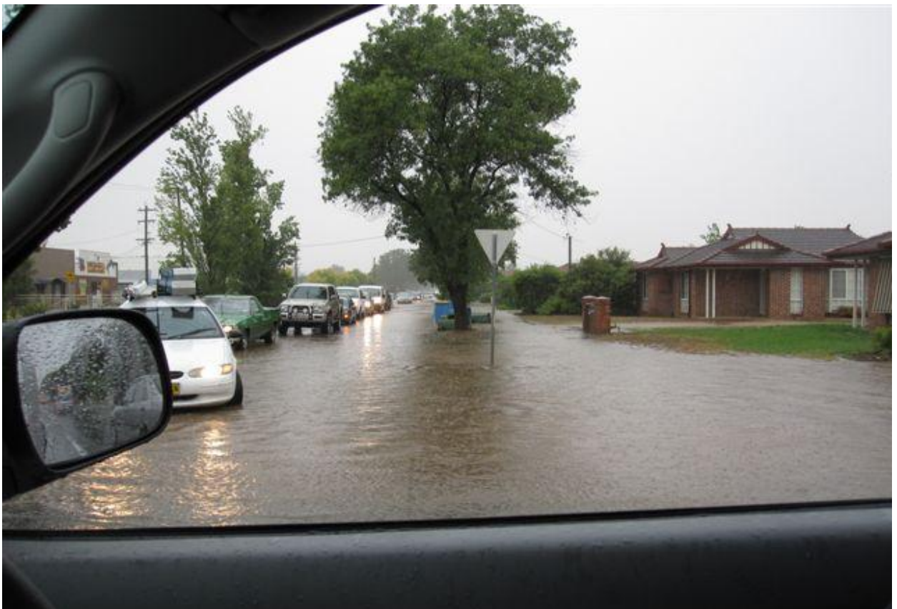
Figure 43 – Looking East up Morgan Street