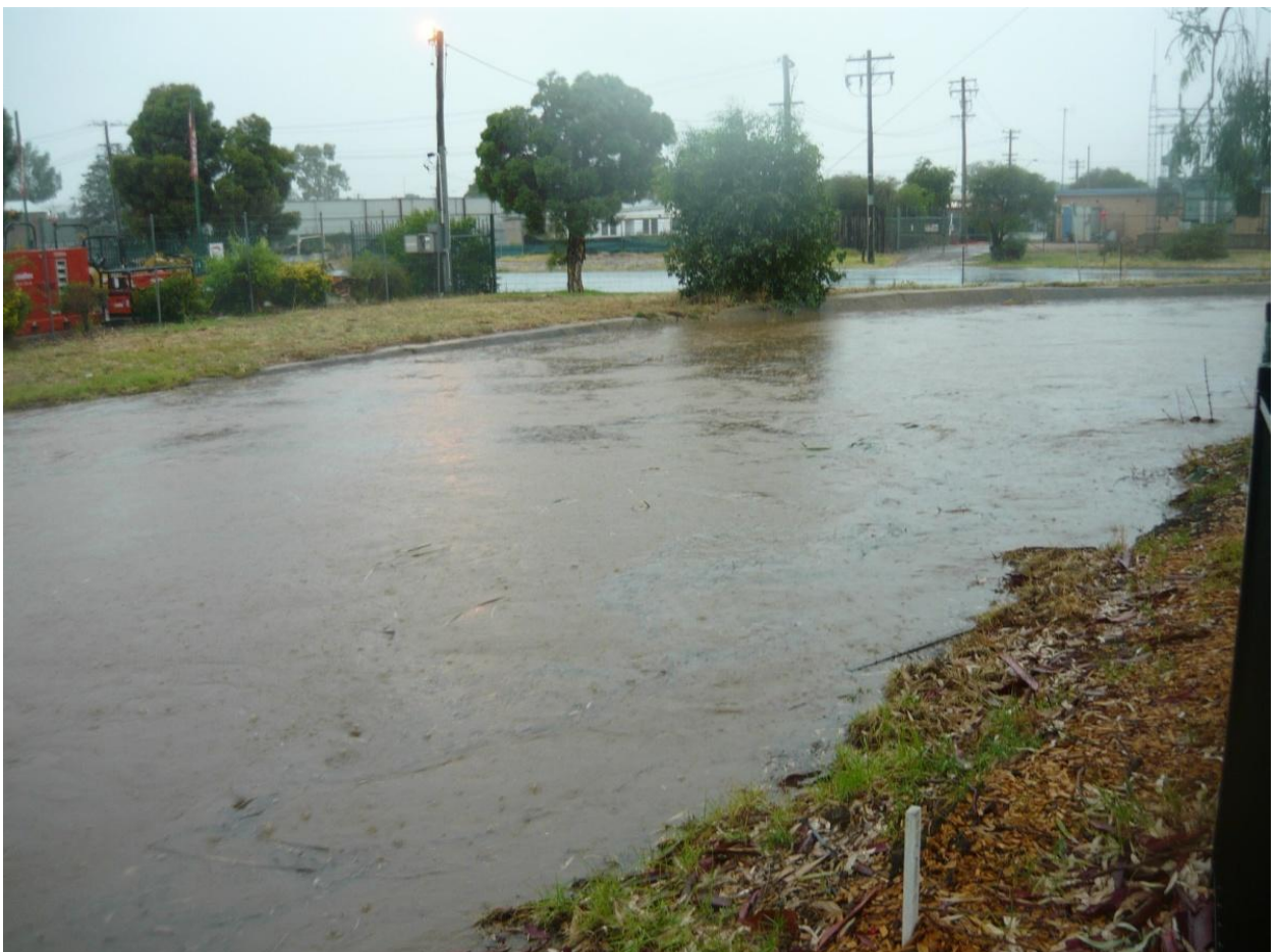
Figure 11 - Looking North-East with Bunnings behind observer at drain bend