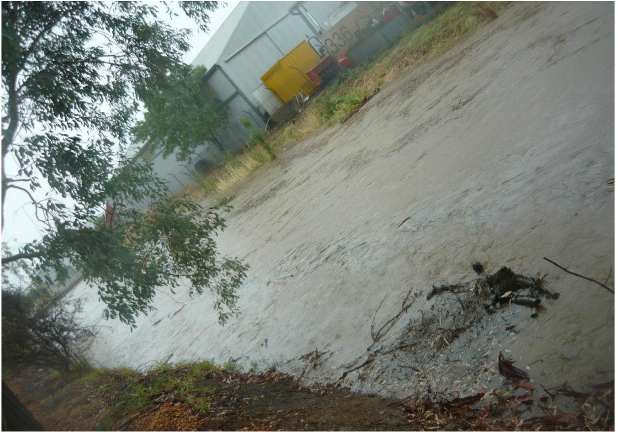
Figure 28 – Looking North-West from Northern boundary of Bunnings.