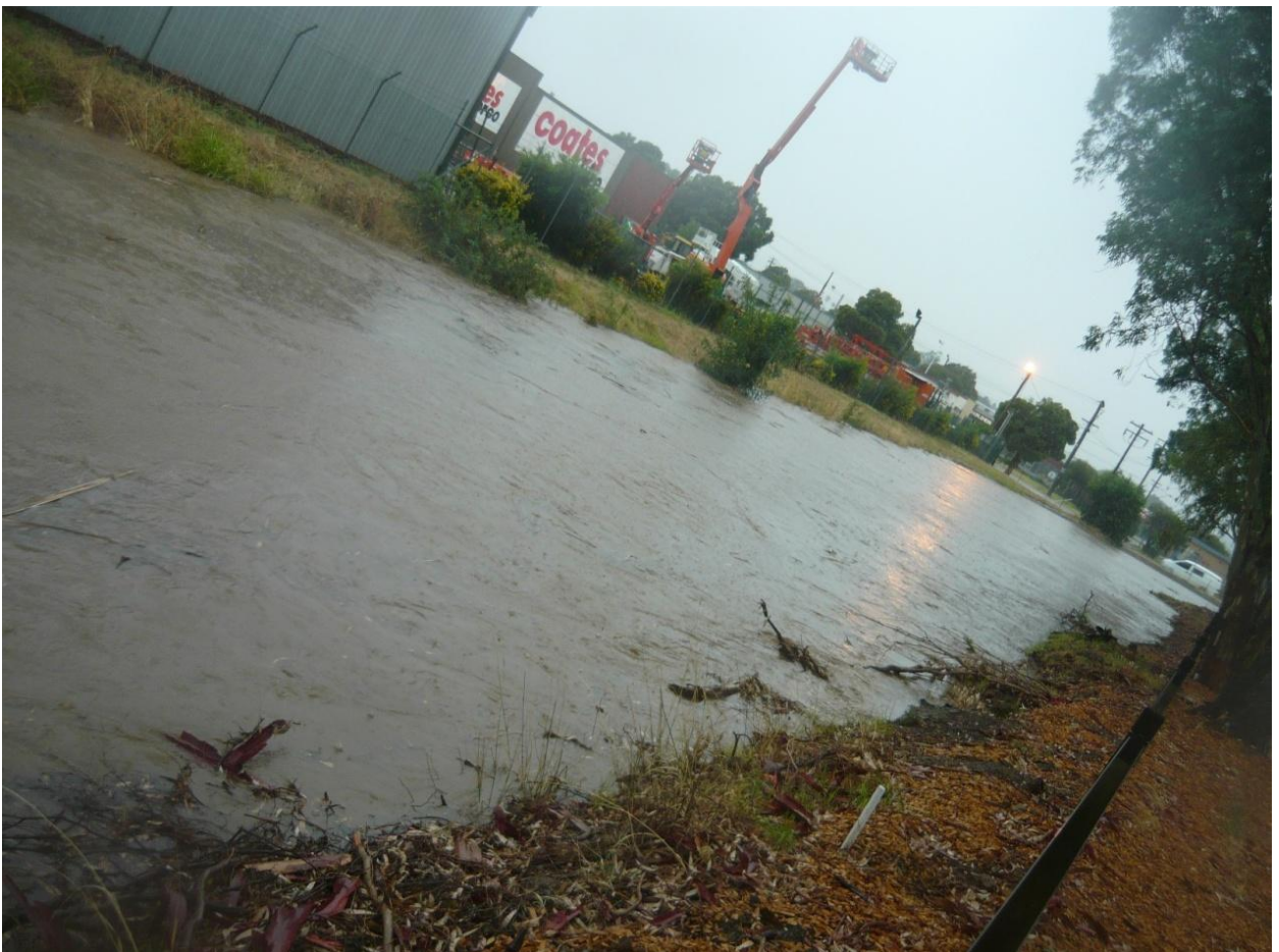
Figure 27 – Looking North-East from Northern boundary of Bunnings