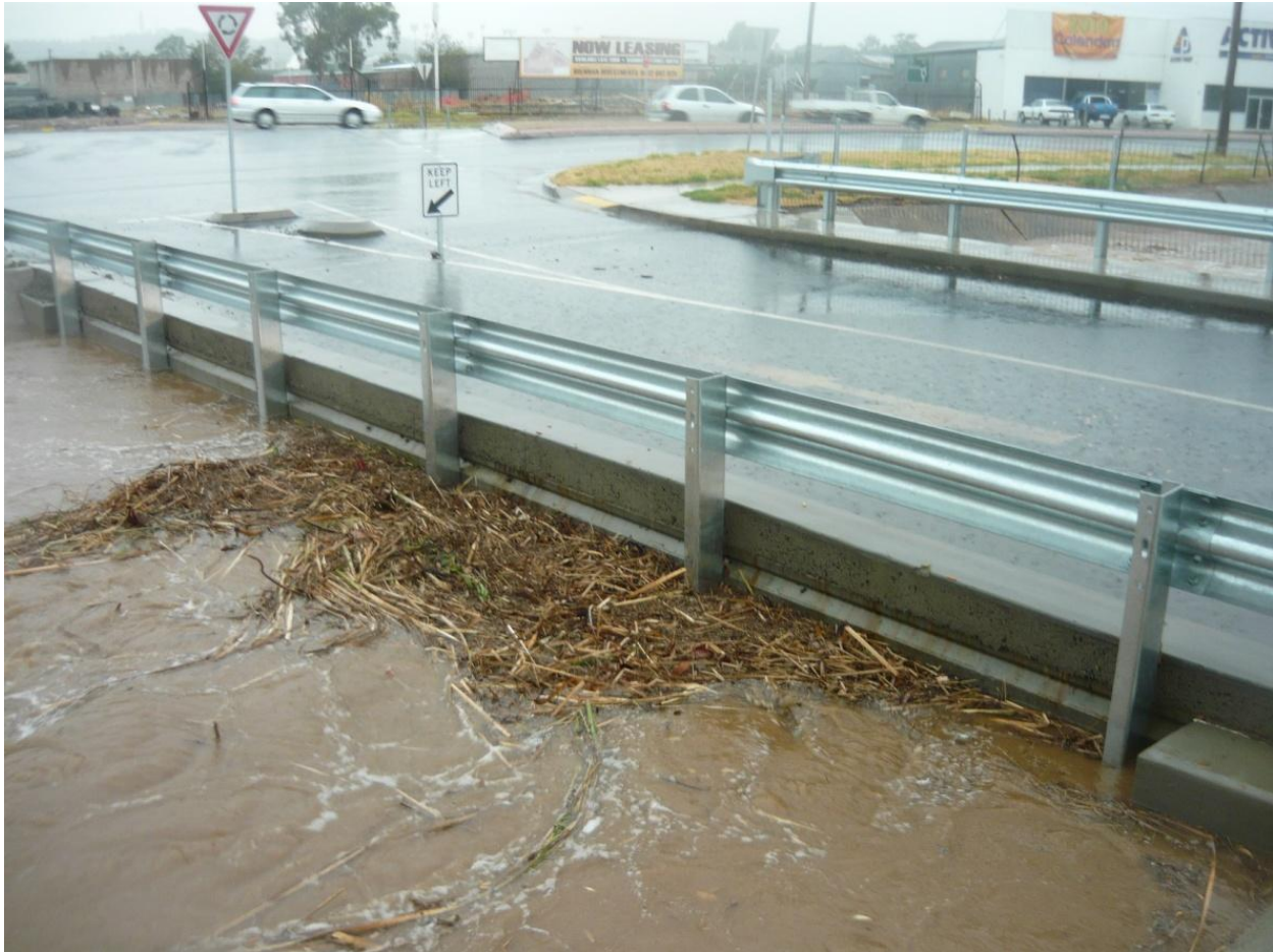
Figure 15 - Bunnings Bridge (Eastern) looking east