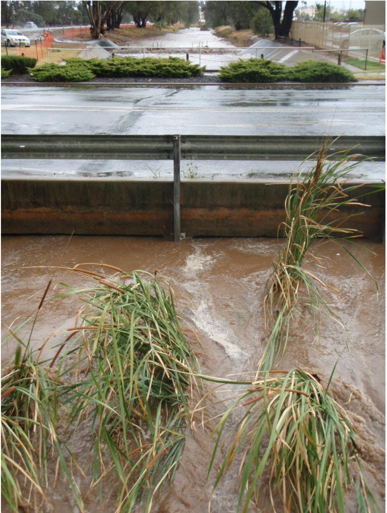
Figure 18 Unknown Event