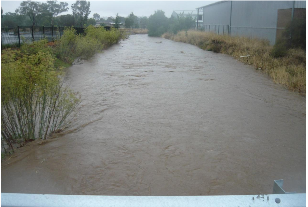
Figure 5 - Bunnings Bridge on Northern side looking D/S and West