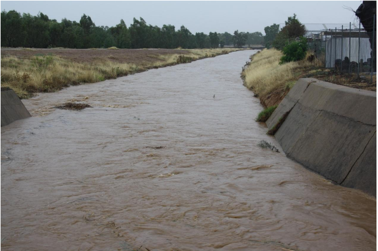
Figure 24 – Looking North with Ashmont confluence to left rear of picture