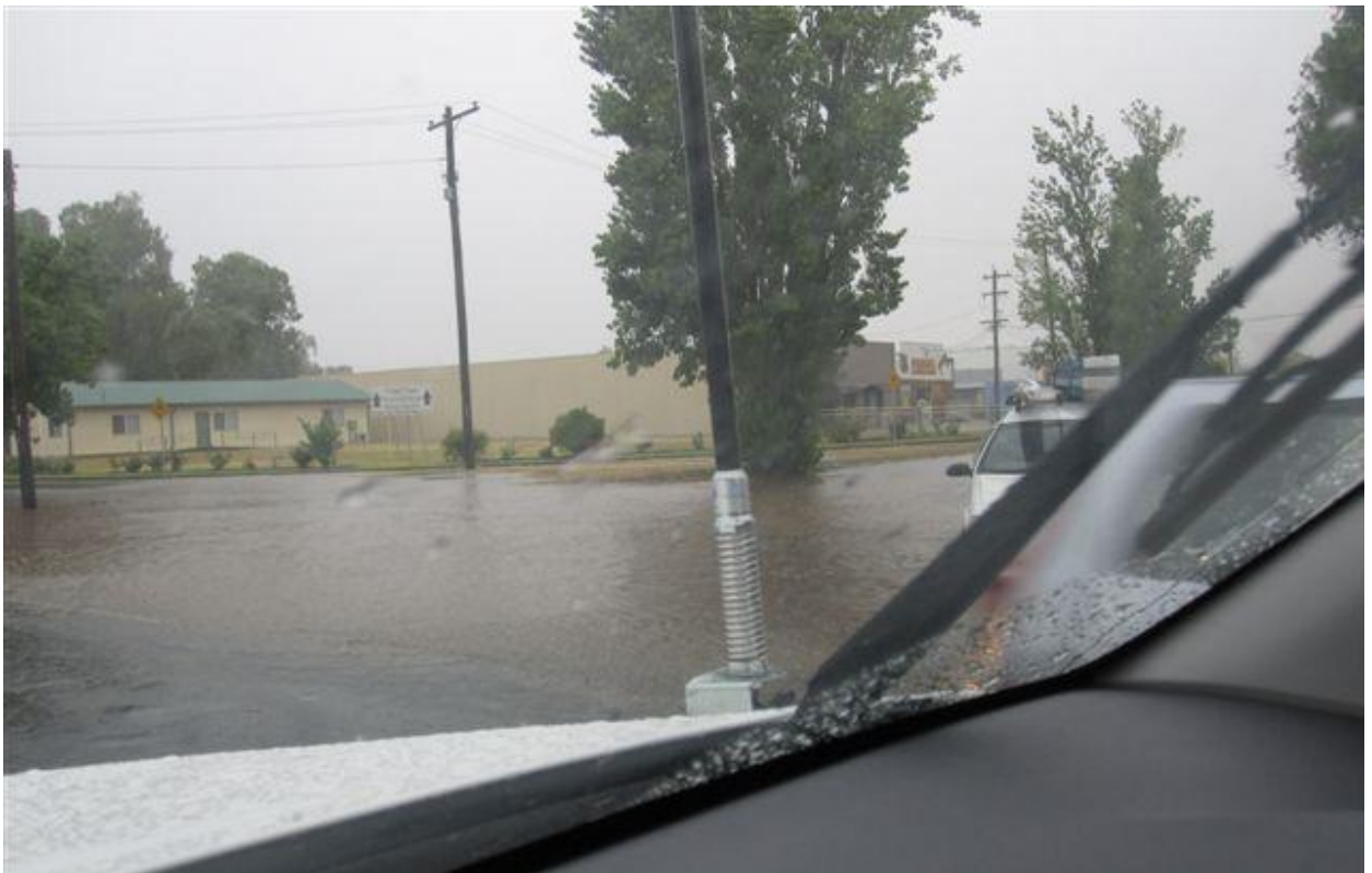
Figure 41 – Corner of Morgan & Docker Streets looking to the North-East