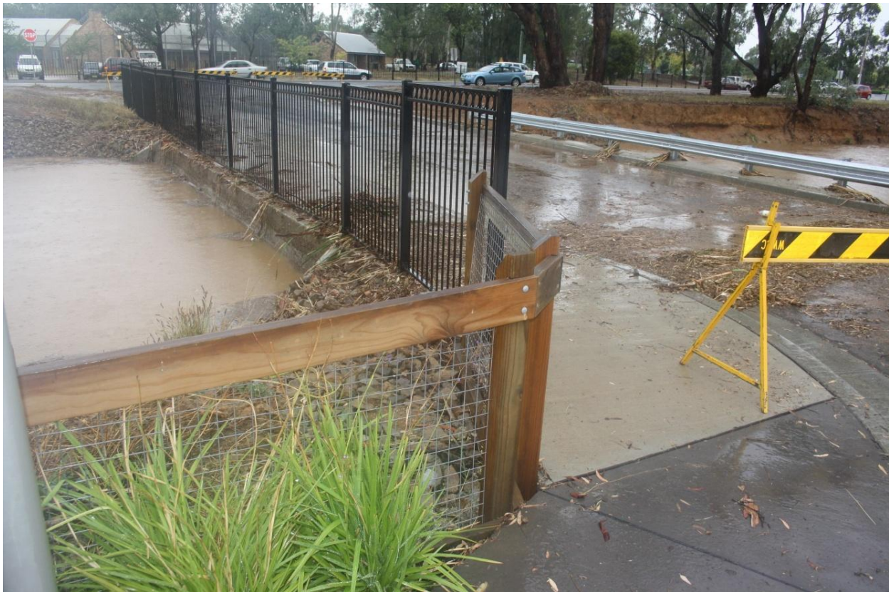
Figure 14 - Looking East from McDonalds Bridge (Remand Centre in background)