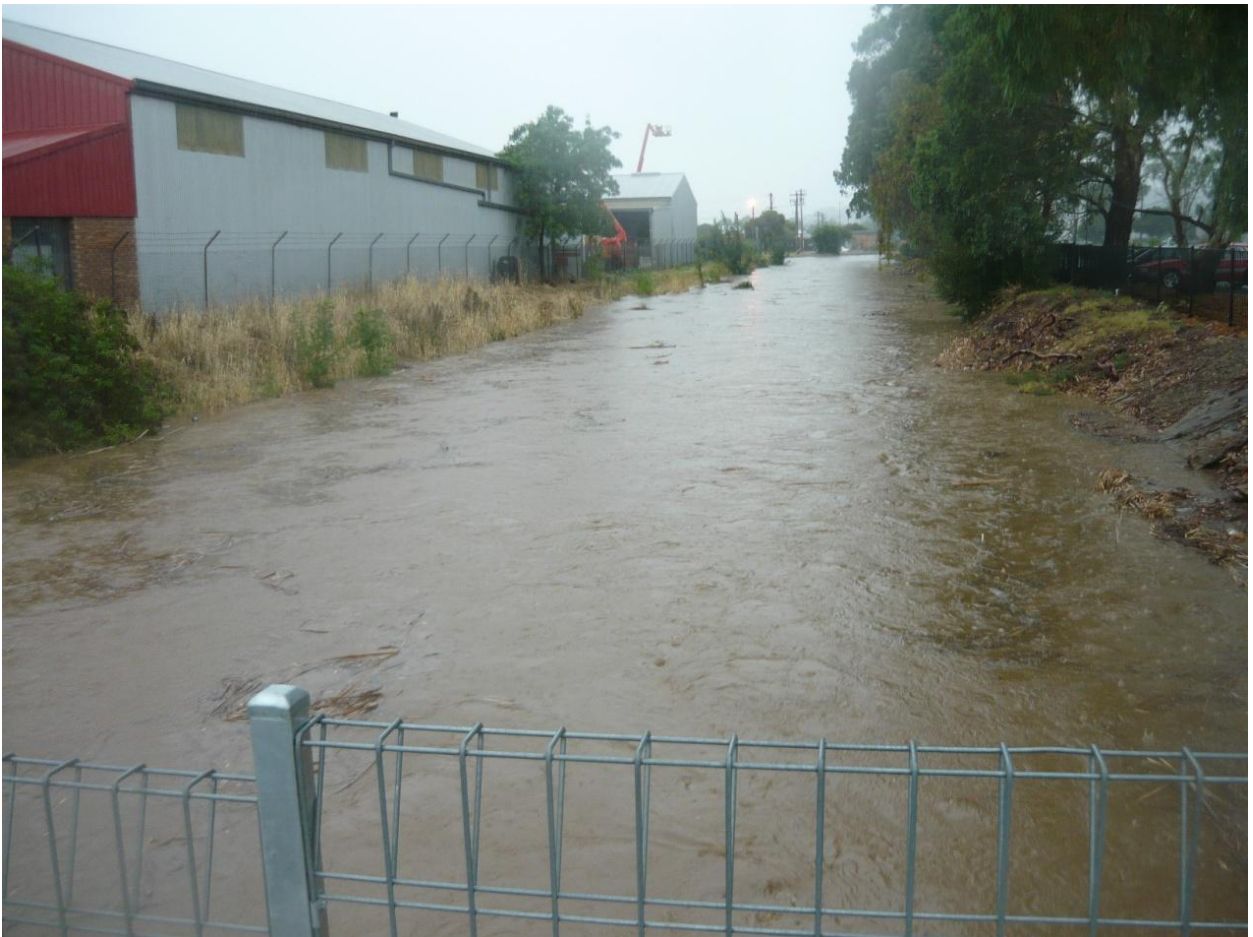
Figure 25 – Bunnings Bridge (northern) looking U/S