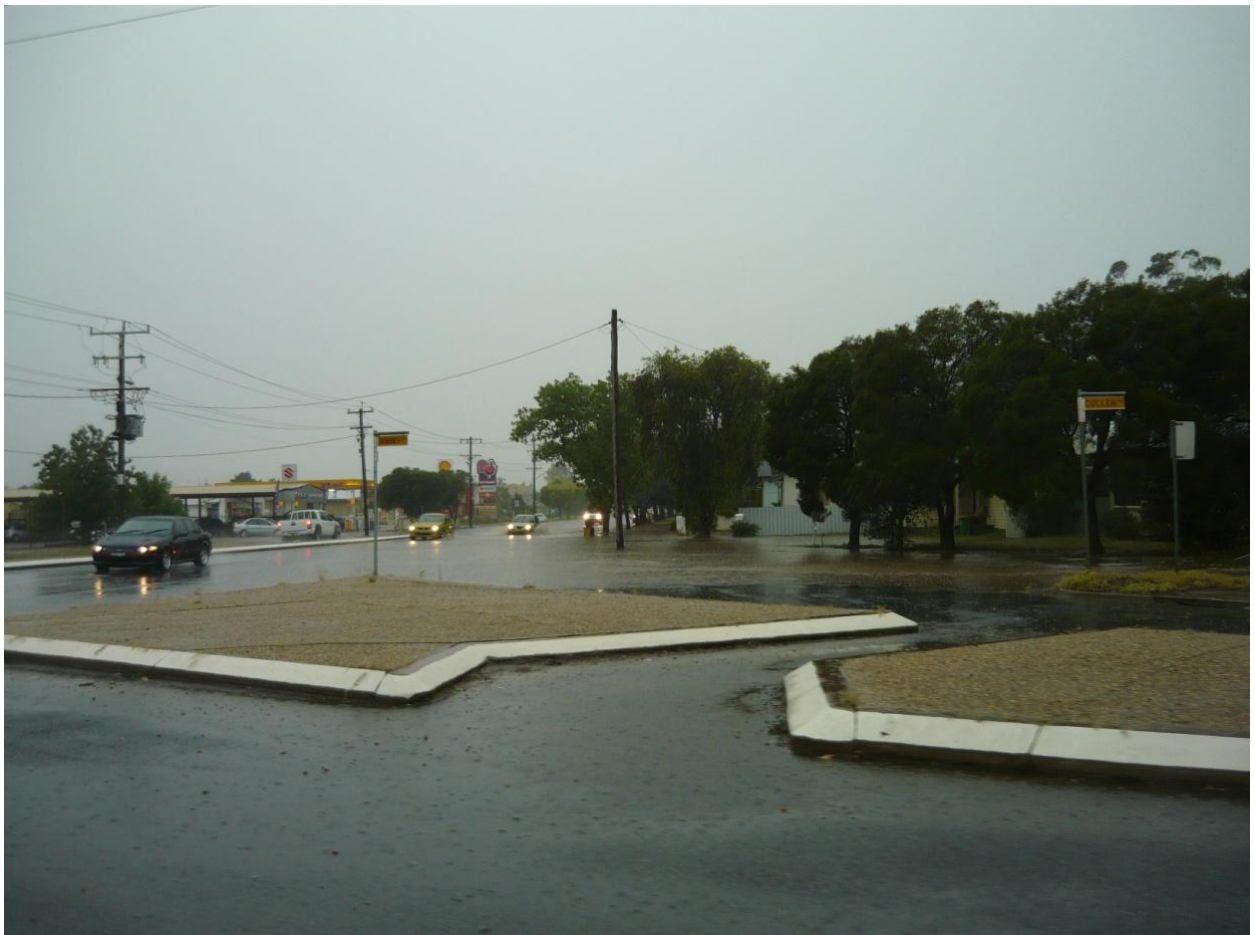
Figure 13 - Edward-Dobney-Cullen Intersection