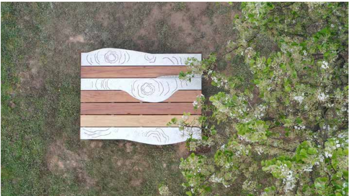
Carla Gottgens, The Surface , 2024. Currawarna Community Centre and playground.

The Public Art Plan is a framework for public art in the City of Wagga Wagga and surrounding villages, outlining the scope of commissions and projects for the period of 2022–2026.