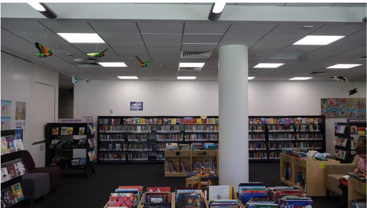
Wall 3 (above shelves)

Dimensions: 5575mmx 2890mm (eastern wall)