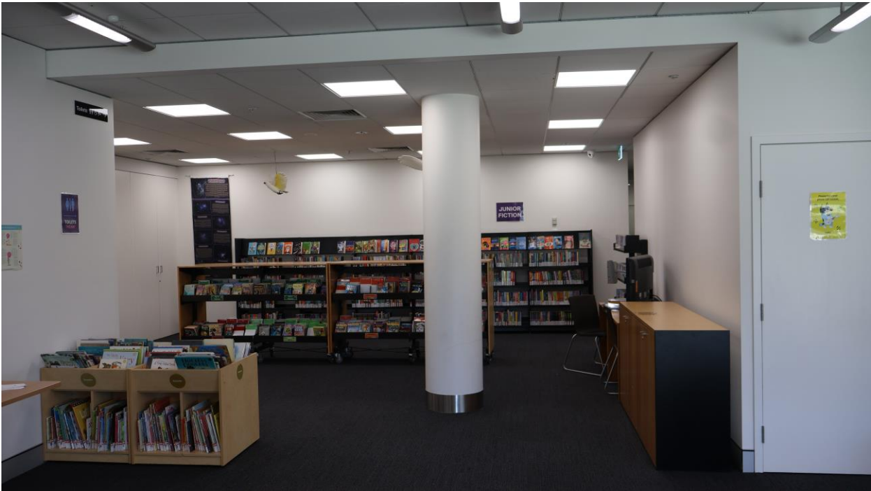
Wall 4 (above shelves)