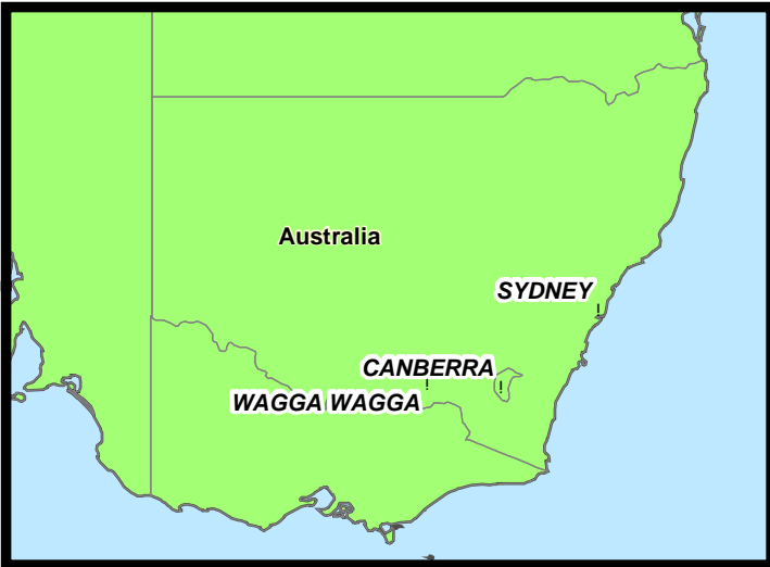
FIGURE 1 STUDY AREA LOCATION