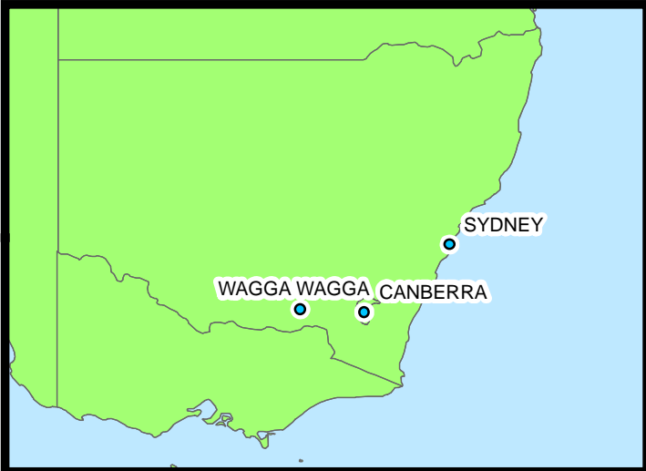
FIGURE 1.1 STUDY AREA LOCATION